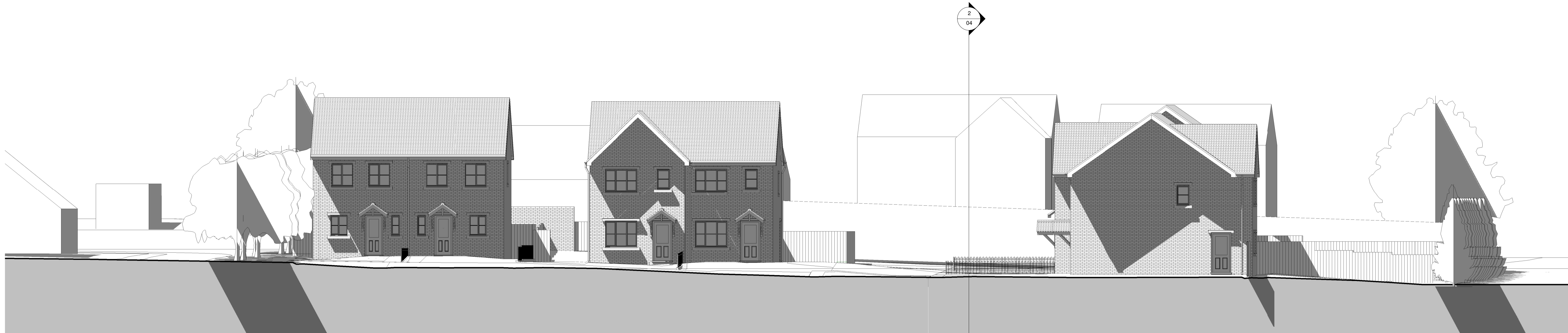
Section - A North South Looking West - As Proposed 1 : 100