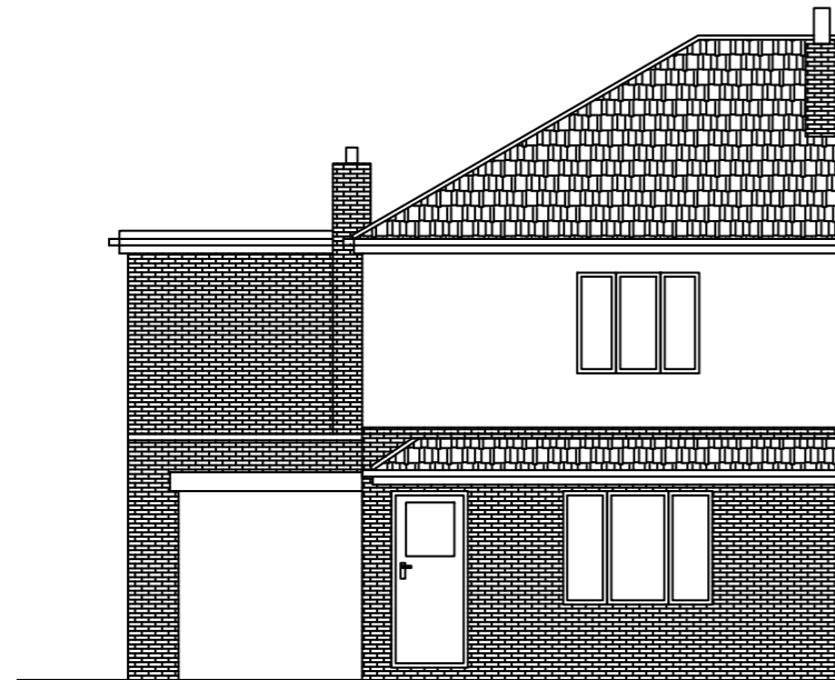
EXISTING FRONT ELEVATION SCALE 1:100 AT A3