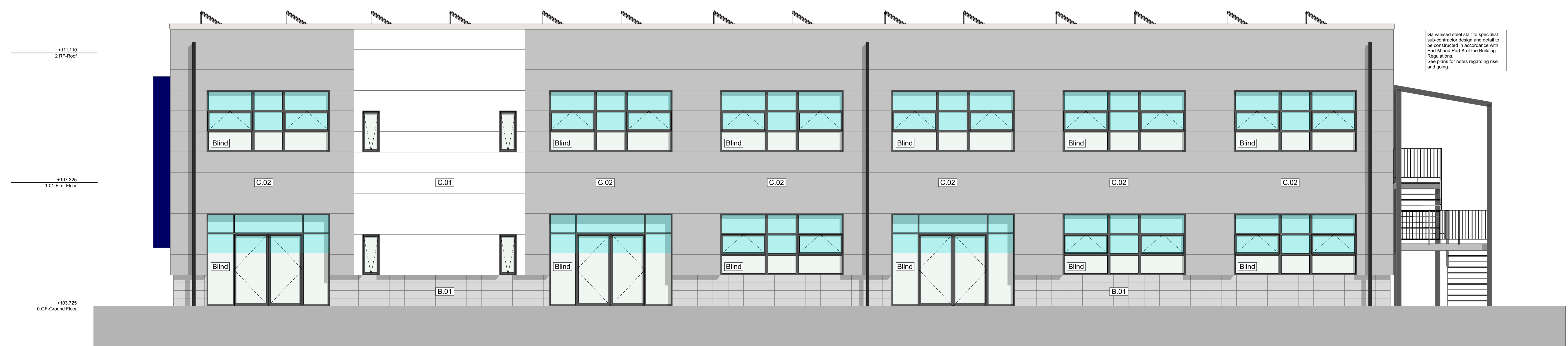
West Elevation 1:50

All windows have updated operer positions. See all elevations. Drawings are not in accordance with SAS Specification. This drawing supersedes all other drawings.