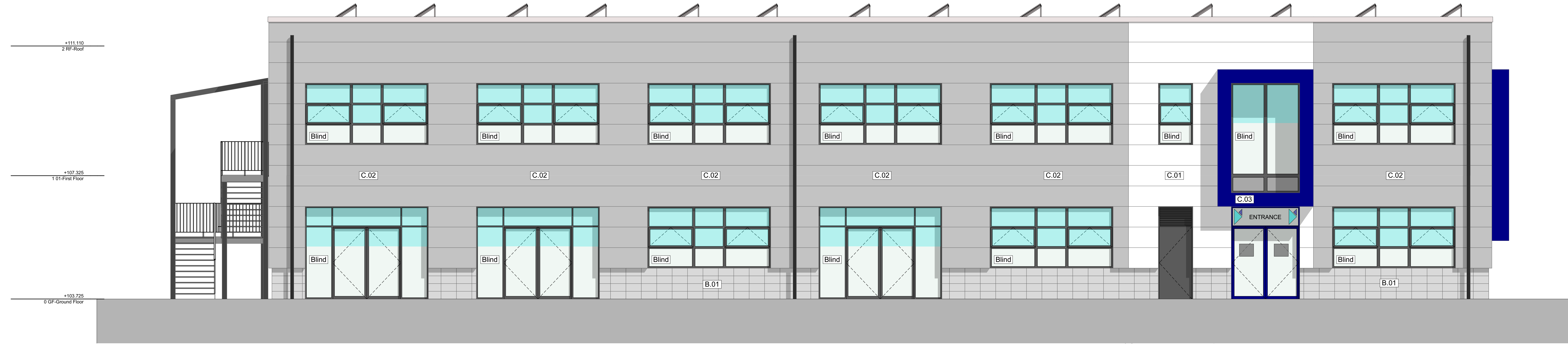
East Elevation 1:50