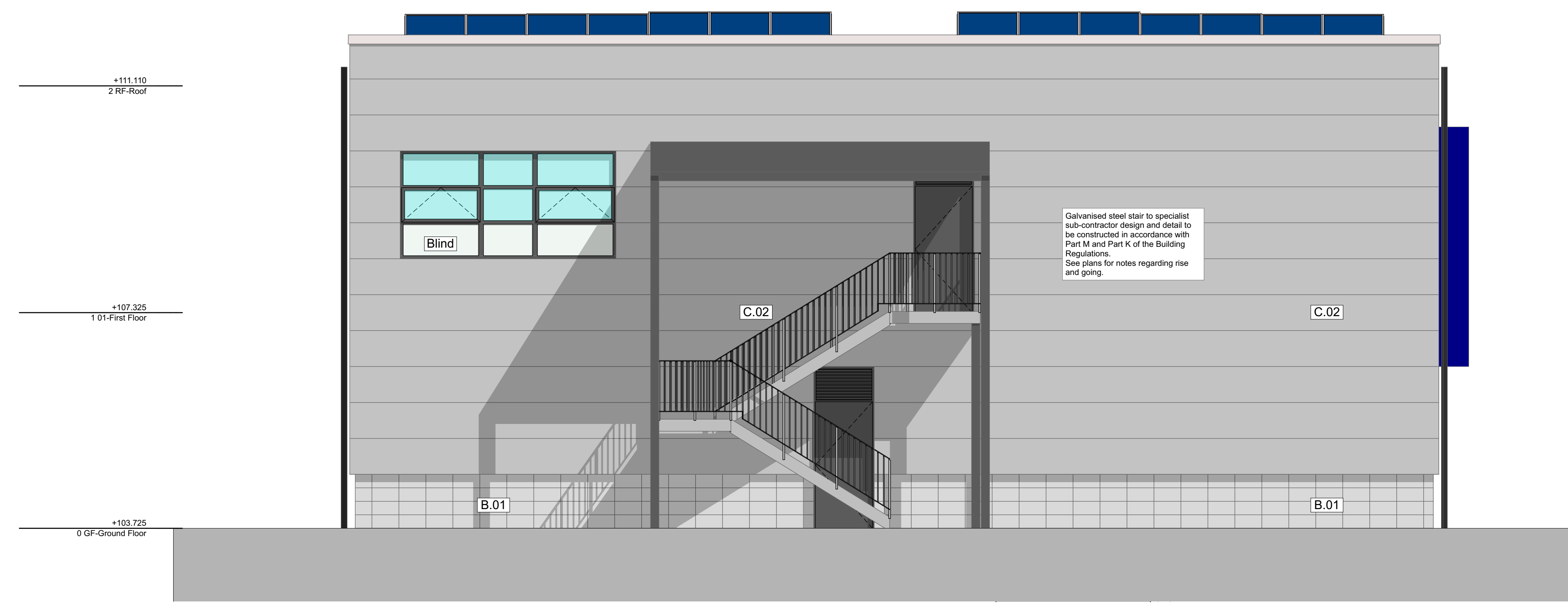
South Elevation 1:50