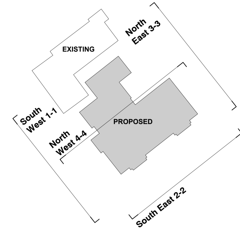
KEY PLAN - NOT TO SCALE

Notes Do not scale, use figured dimensions only. All dimensions to be verified on site prior to the commencement of any work or the production of any shop drawing. All discrepancies to be reported to the Architect. This drawing is to be read in conjunction with all related Architect's and Engineer's drawings and any other relevant information. This drawing is copyright © of DWA Architects Ltd.