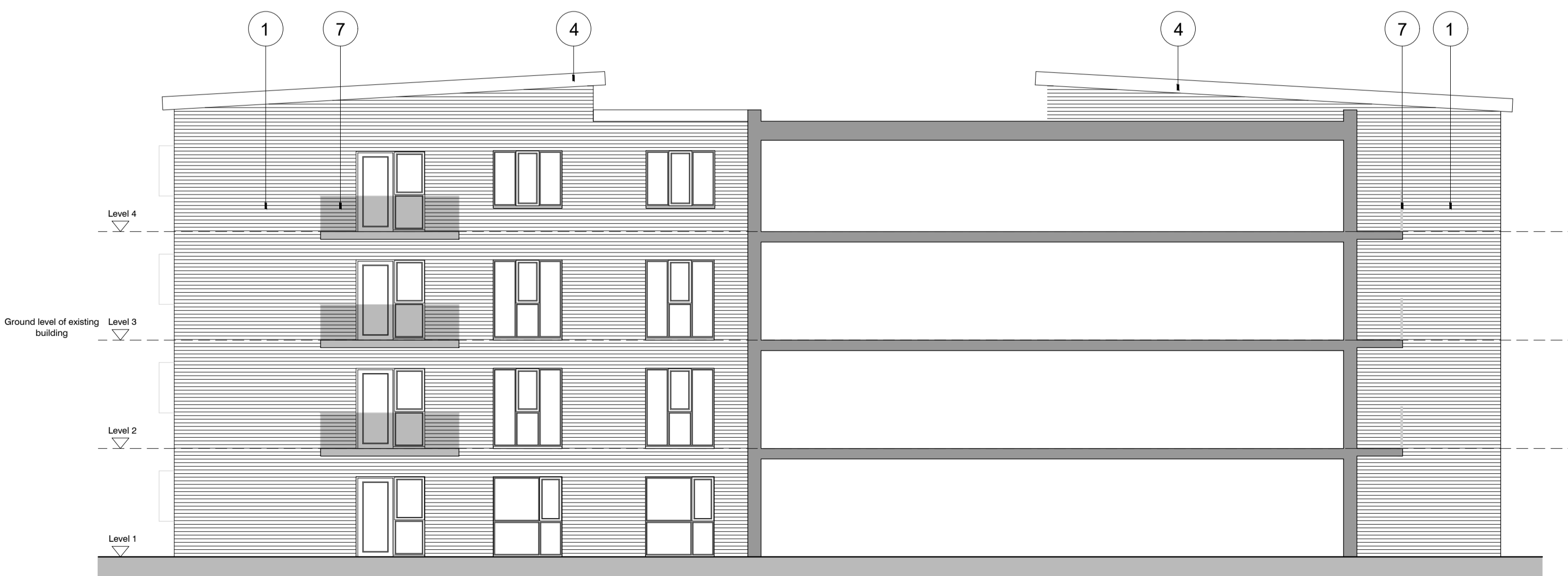
PROPOSED 4-4 NORTH WEST ELEVATION