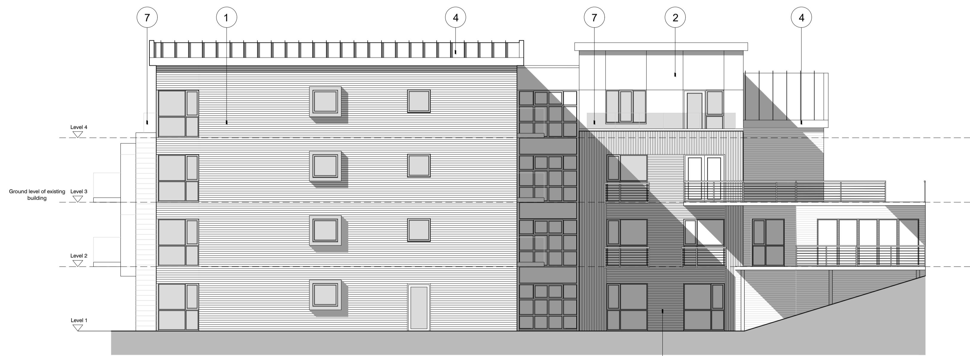
PROPOSED 3-3 NORTH EAST ELEVATION