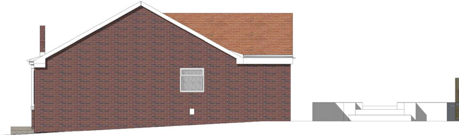
SIDE ELEVATION (R)