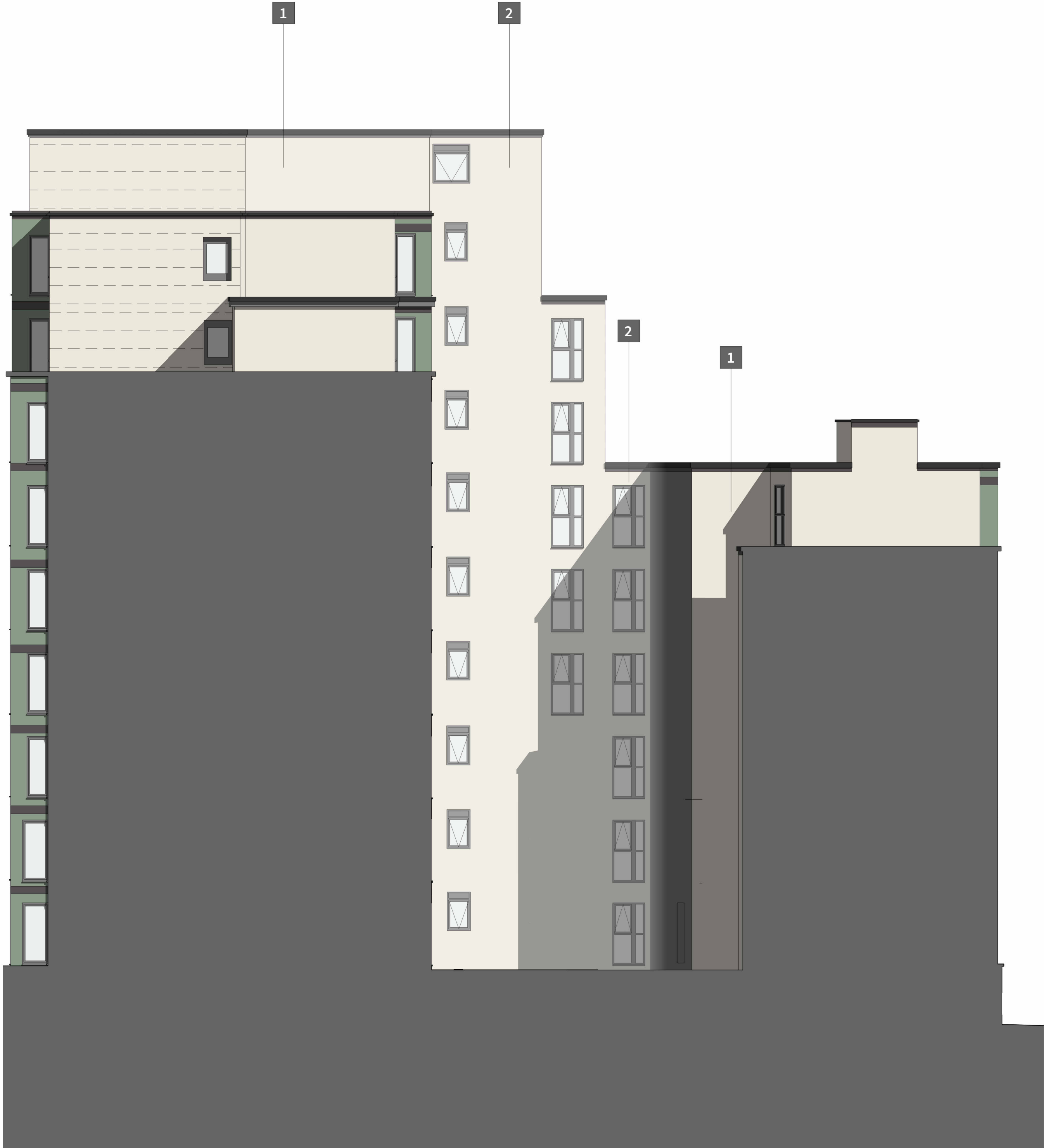
2 Existing_Elevation - Courtyard B 1:100