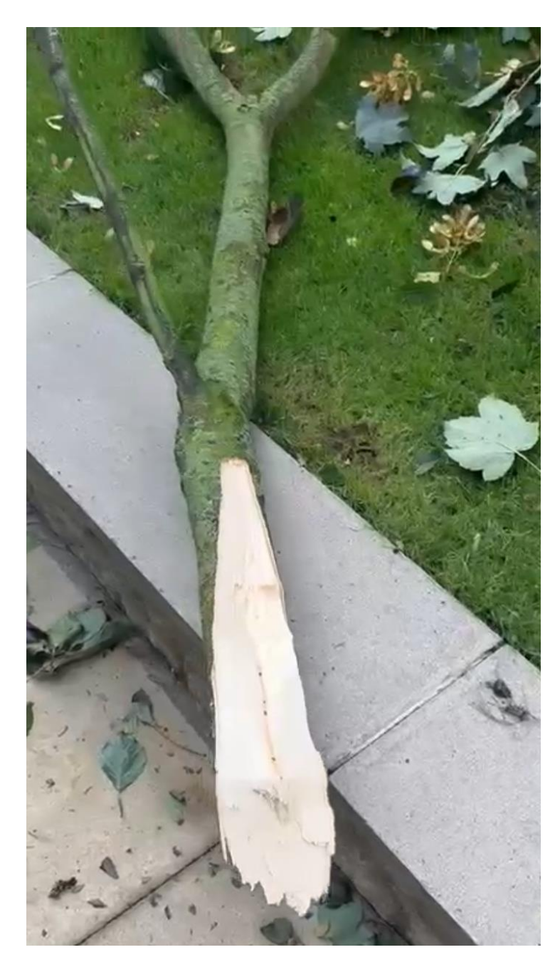
Photo 3: Still taken from a video of branch that failed from T1 on 23^{\rm rd} August 2024