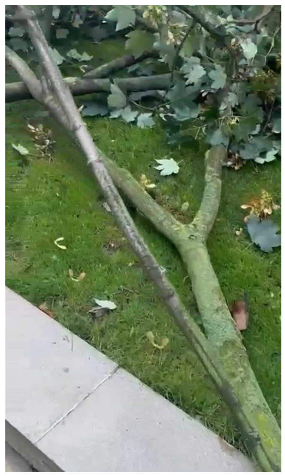
Photo 5: A further still from a video taken of the branch failures from T1 on 23^{\rm rd} August 2024.