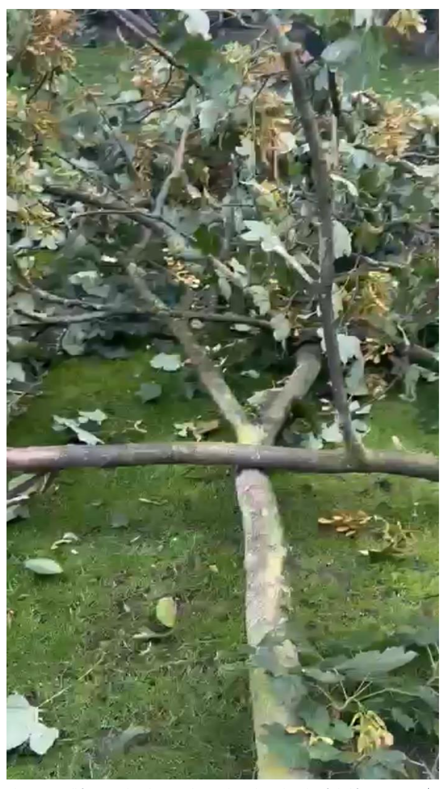
Photo 4: A still from a video showing the two large branches that failed from T1 on 23<sup>rd</sup> August 2024.