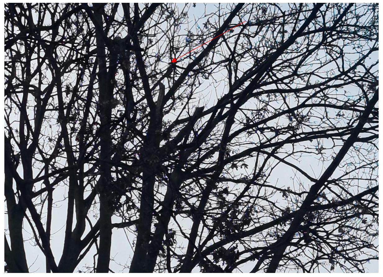
Photo 1: Tree T1- Wounds of branches that failed with canopy of T1, at unions with other branches still attached,