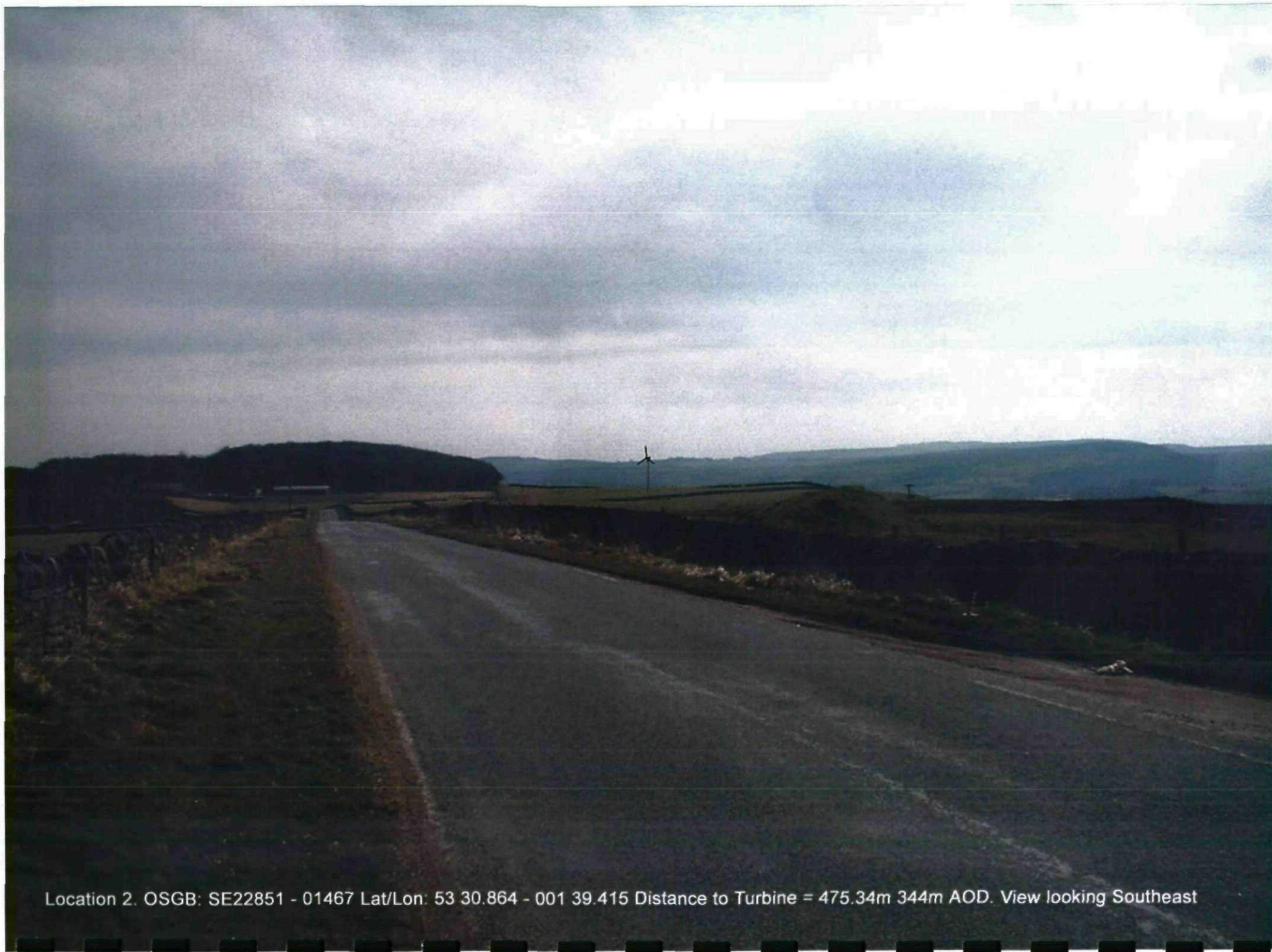
Location 2. OSGB: SE22851 - 01467 Lat/Lon: 53 30.864 - 001 39.415 Distance to Turbine = 475.34m 344m AOD. View looking Southeast