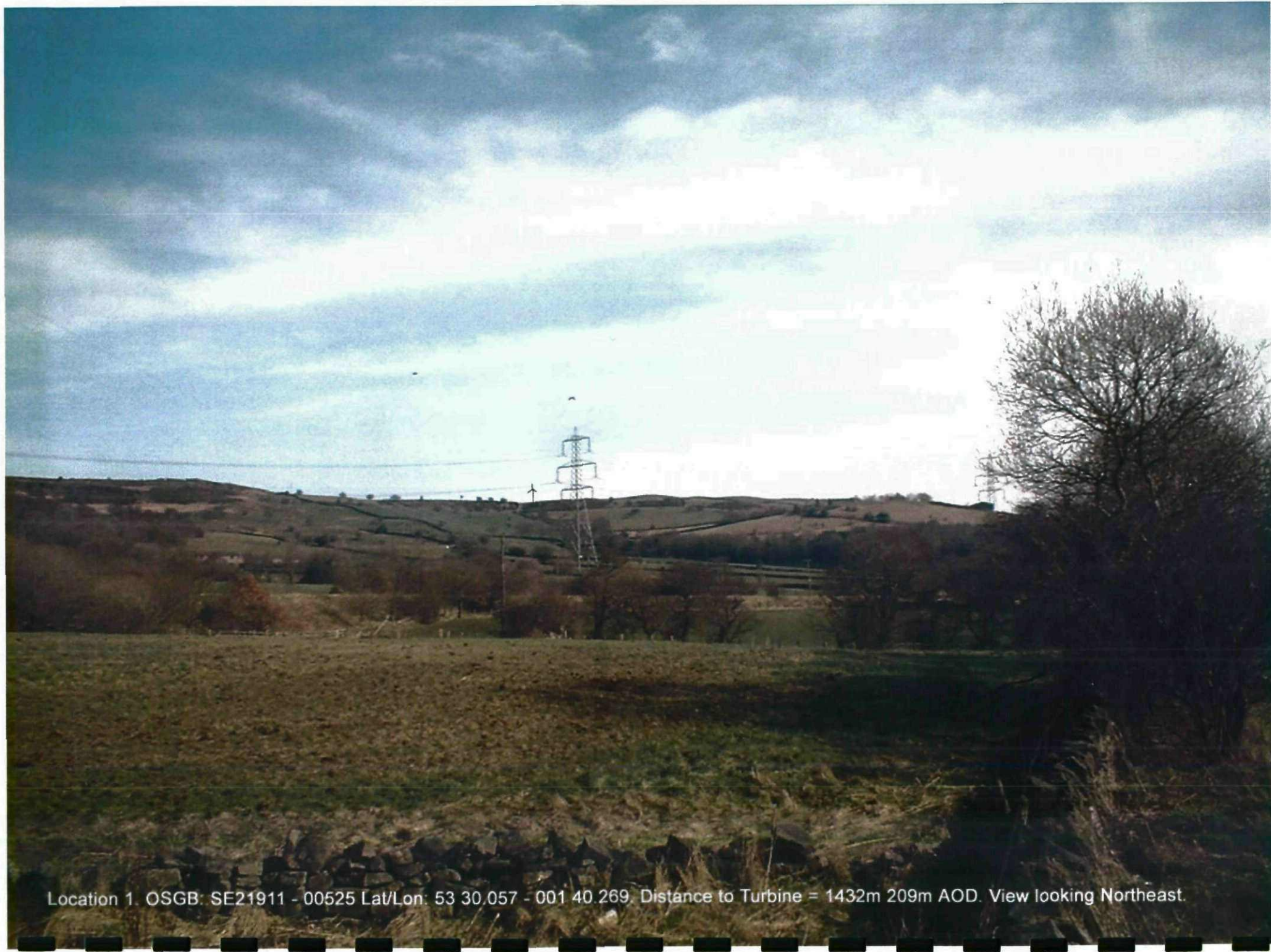
Location 1. OSGB: SE21911 - 00525 Lat/Lon: 53 30.057 - 001 40.269. Distance to Turbine = 1432m 209m AOD. View looking Northeast.