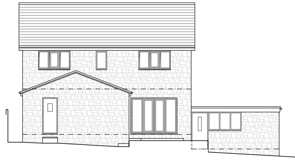
REAR ELEVATION (South)