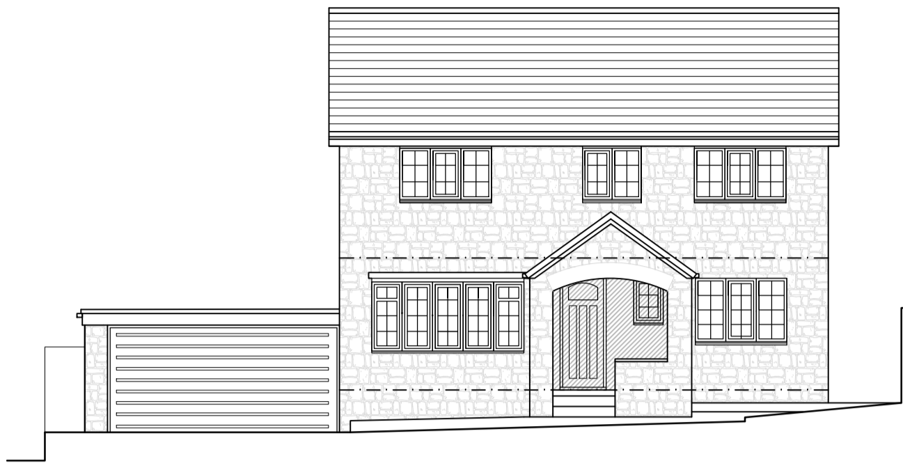
FRONT ELEVATION (North)