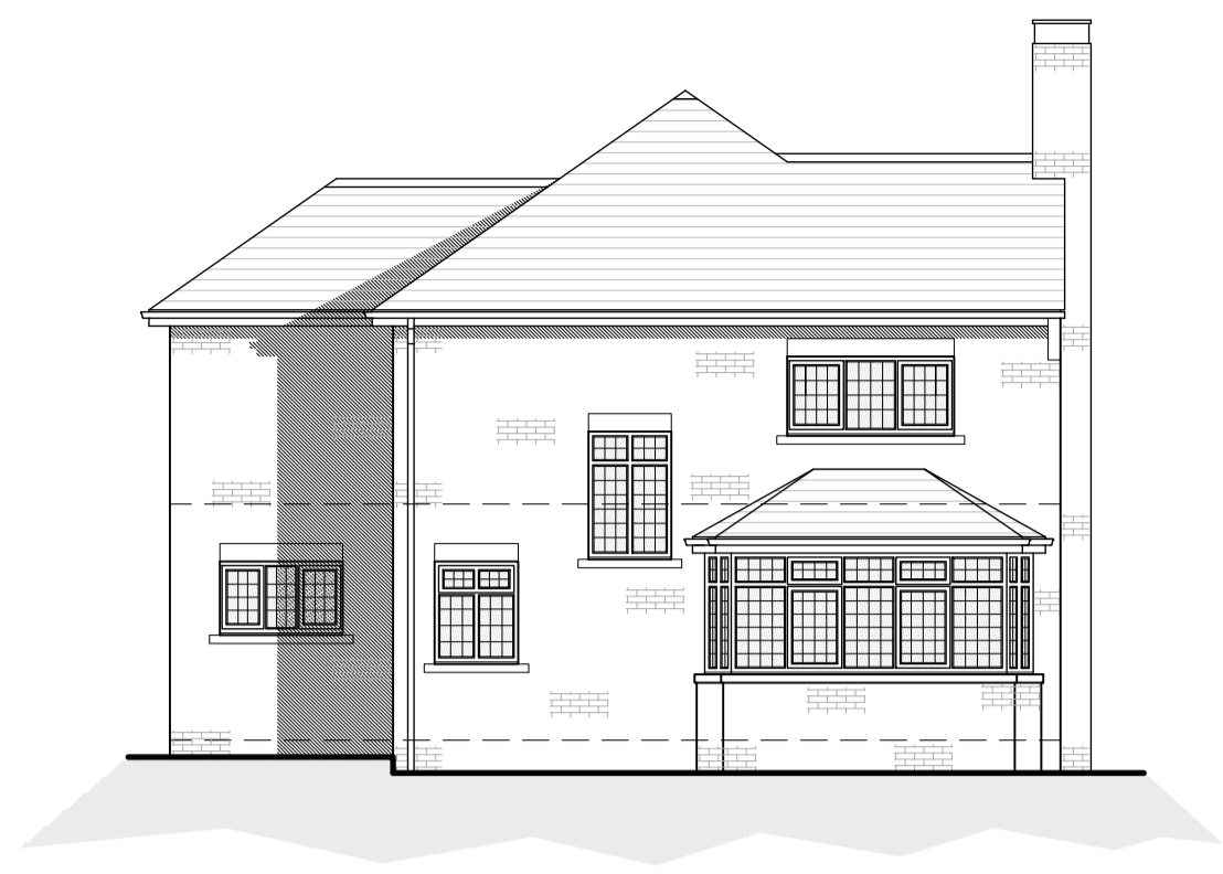
Existing South East Facing Front Elevation Scale 1:100