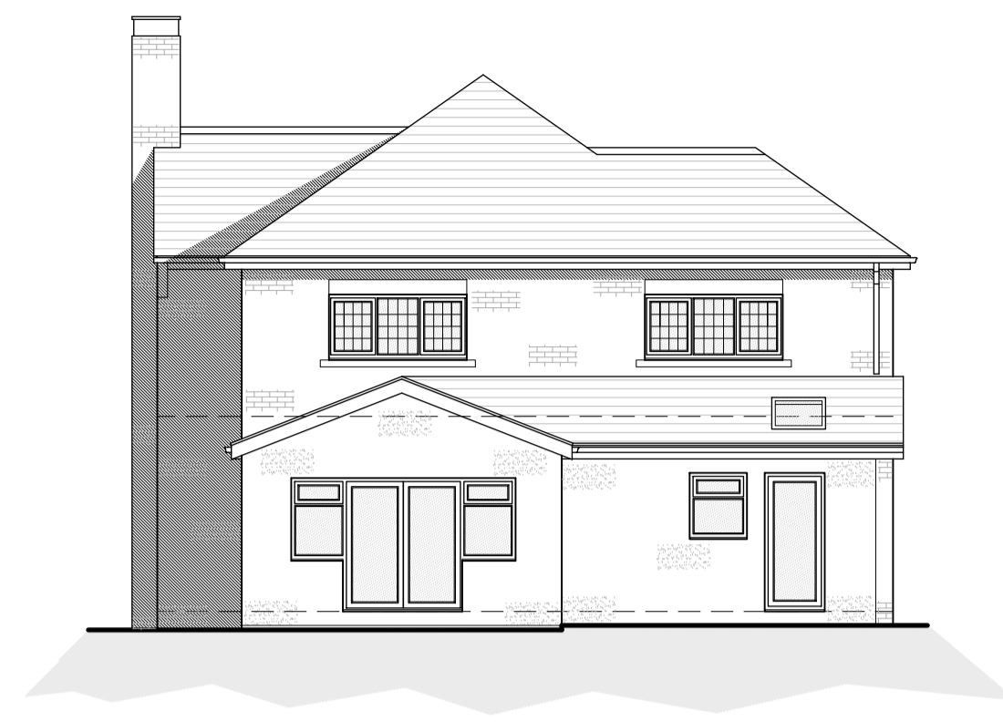
Existing North West Facing Rear Elevation Scale 1:100