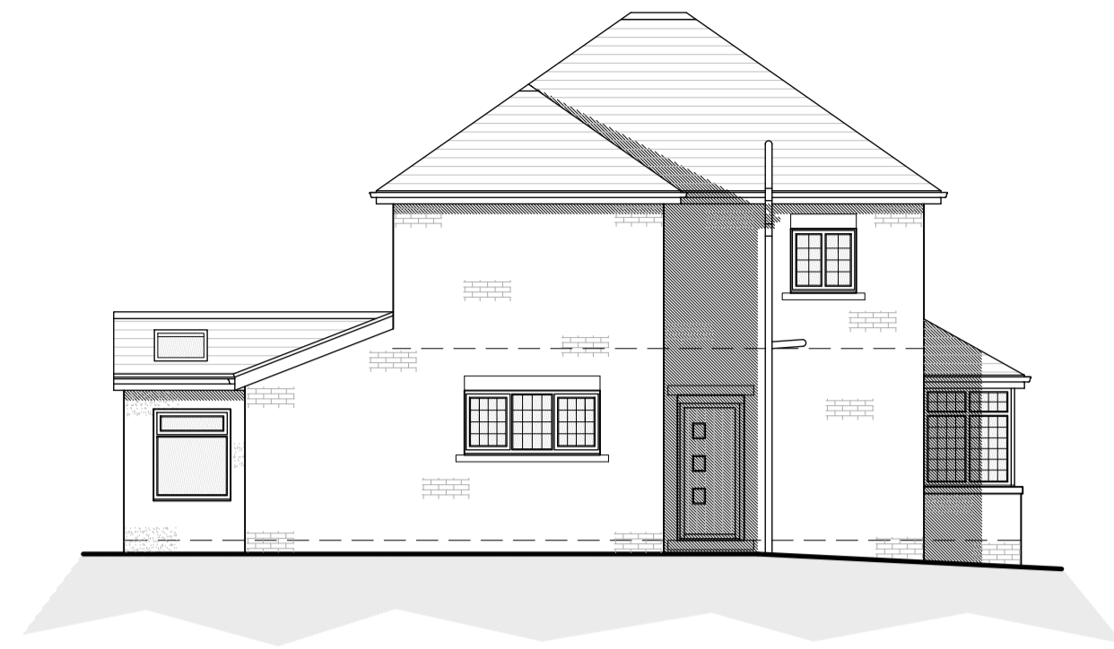
Existing South West Facing Side Elevation Scale 1:100