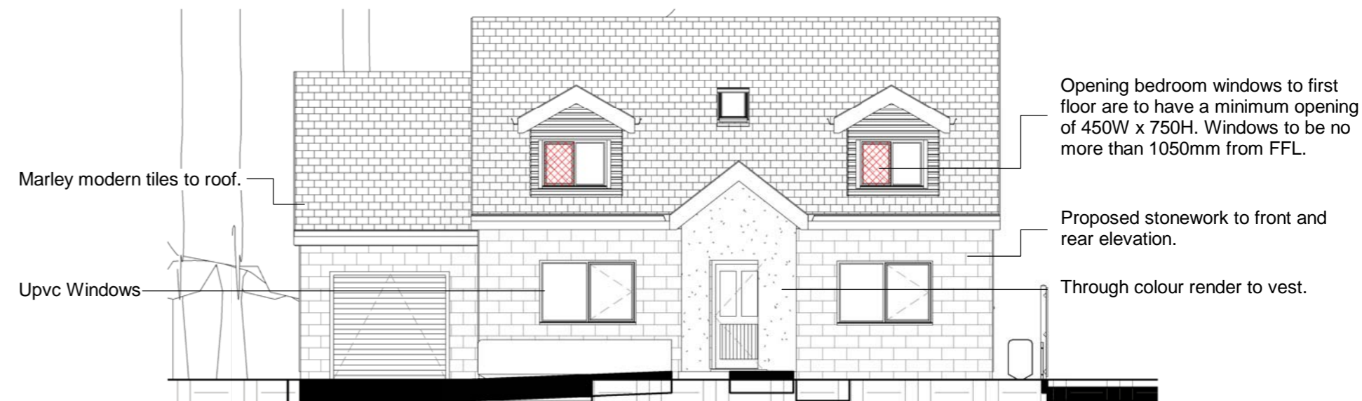
2 Bungalow 1 - East Elevation 1 : 100