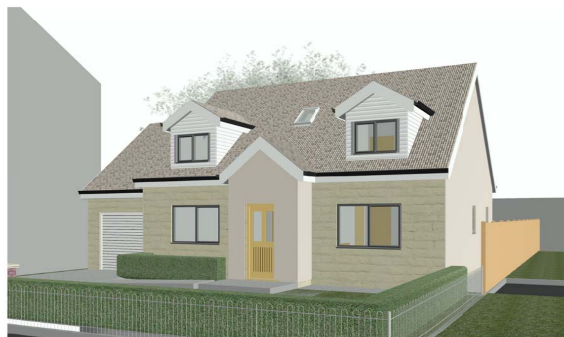
6 3D View 1