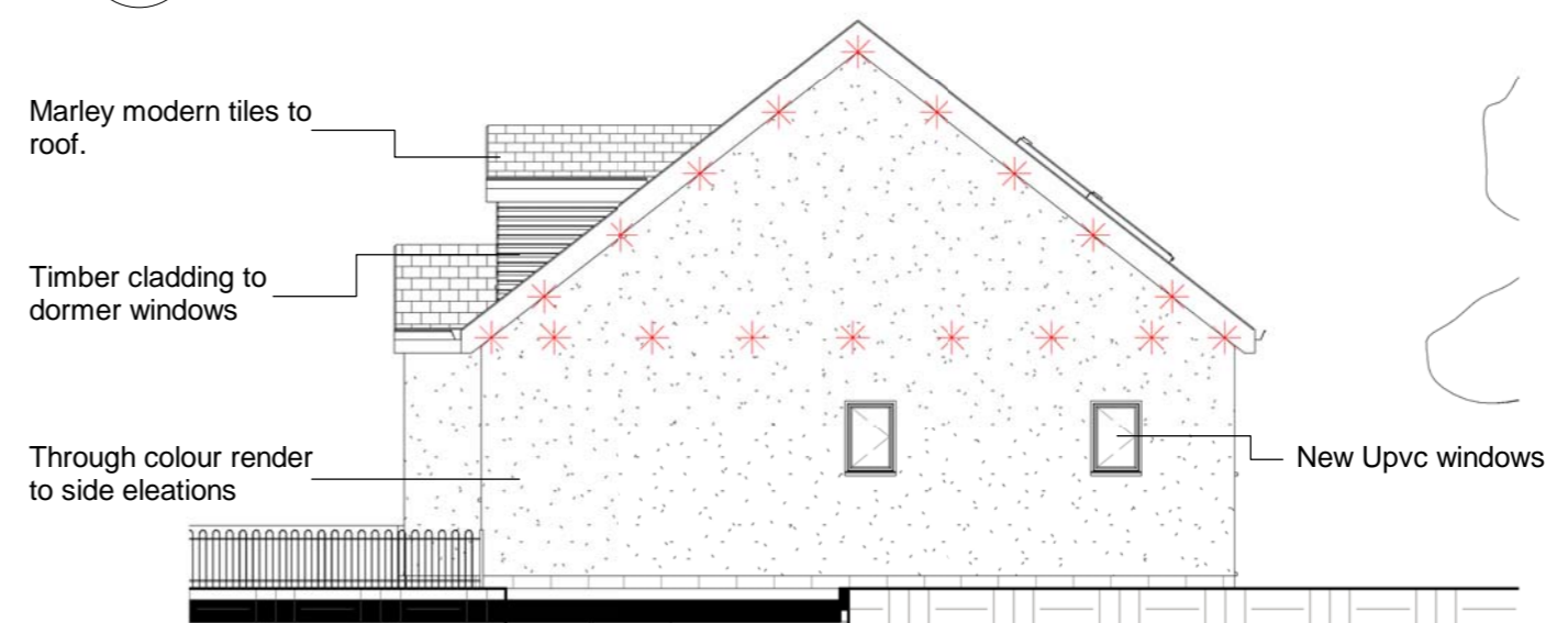
3 Bungalow 1 - North Elevation 1 : 100

Supply and install at 1.2m cc 30x5mm by 1.2m long galvanised steel anchor ties fixed to blockwork inner skin of the external cavity wall and taken across 3No roof joists at roof level and 3No floor joists at first floor level all to be screw fixed in place.