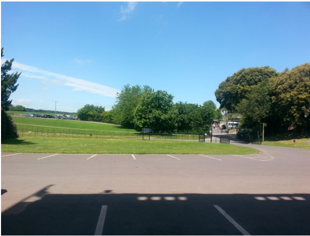
Principal view from Museum Main Entrance towards the Farm