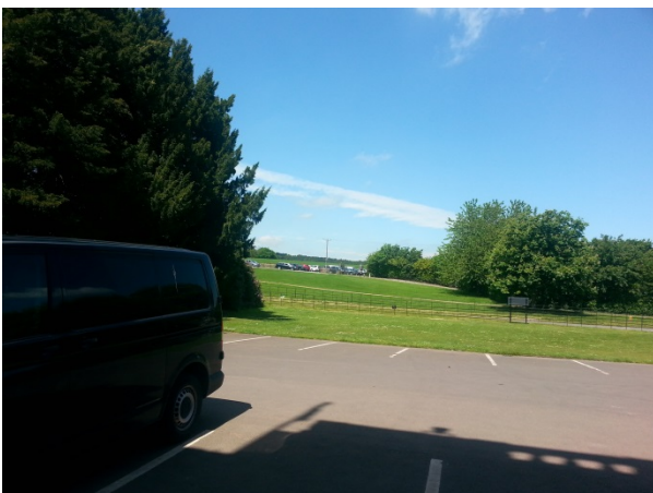
View from Museum Entrance towards the proposed Marquee site