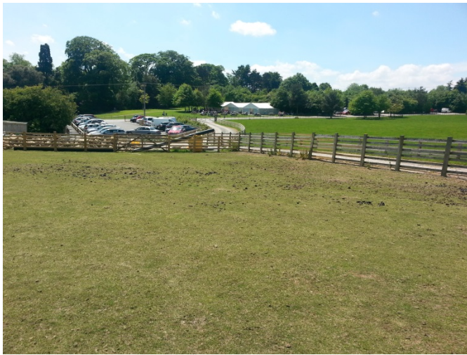
Location proposal for the new Marquee within the existing tree line