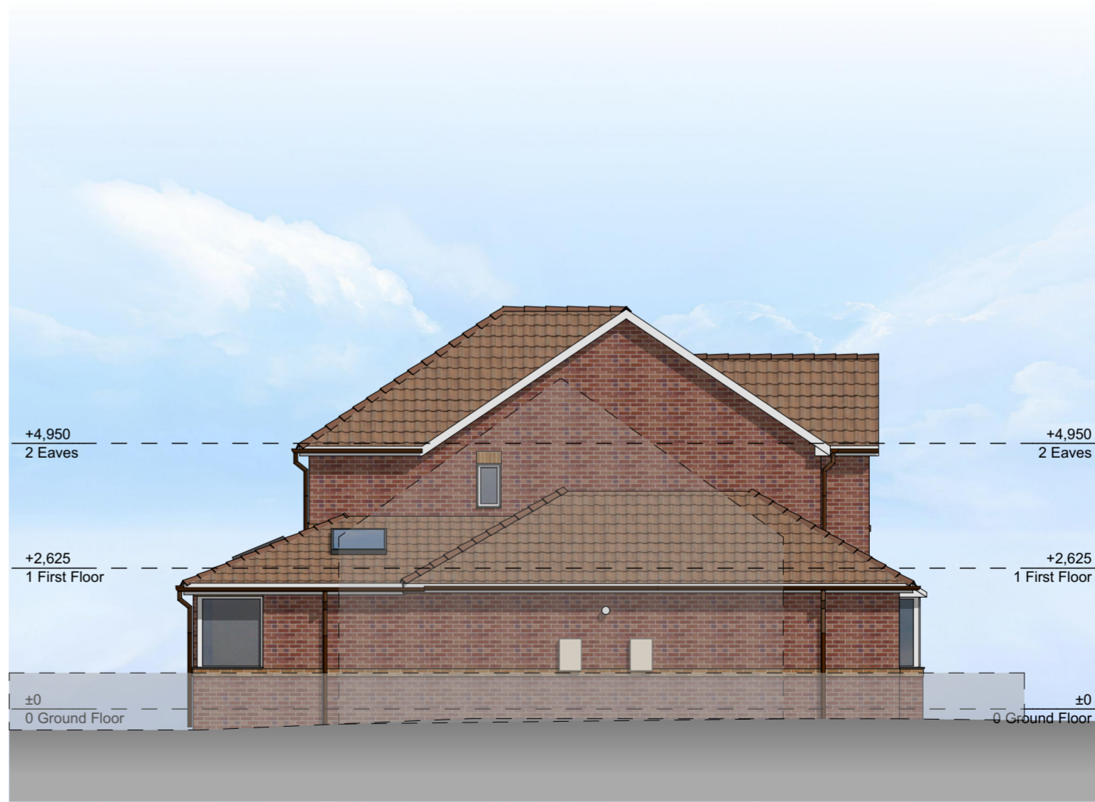
Proposed NE Elevation