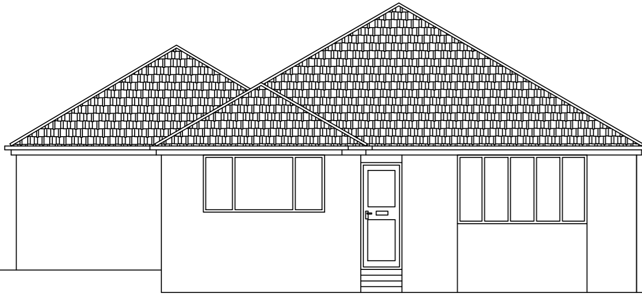
EXISTING FRONT ELEVATION SCALE 1:100 AT A3