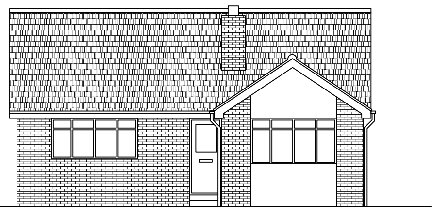
EXISTING FRONT ELEVATION SCALE 1:100 AT A3