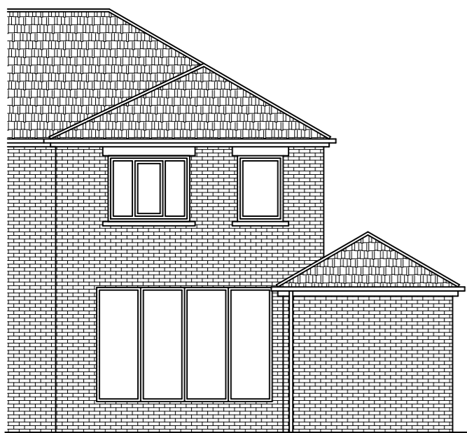
EXISTING REAR ELEVATION SCALE 1:100 AT A3