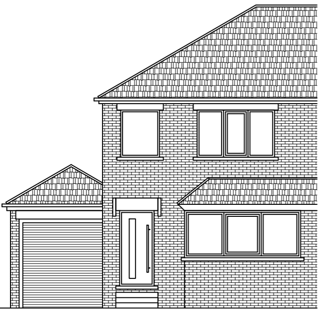
EXISTING FRONT ELEVATION SCALE 1:100 AT A3