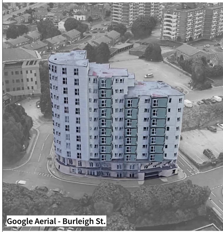
Google Aerial - Burleigh St.