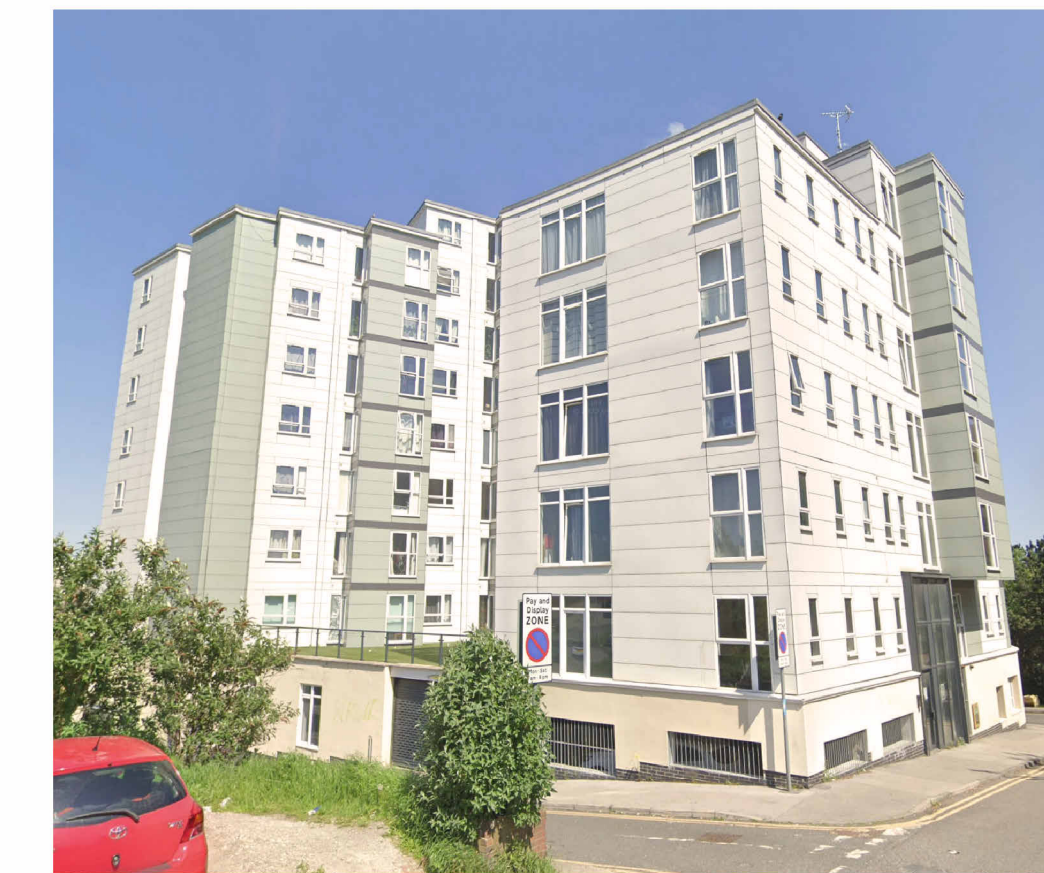
Heelis St. Image Demonstrating existing cladding colour palette.