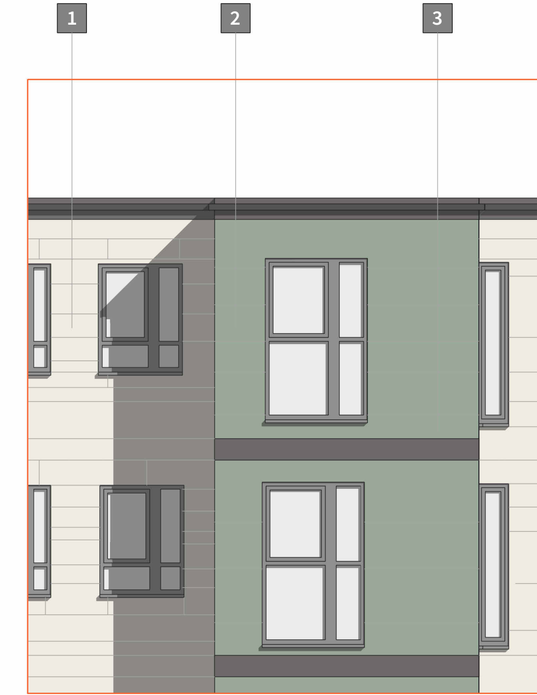
2 Existing Elevation - Materials Key 1:50