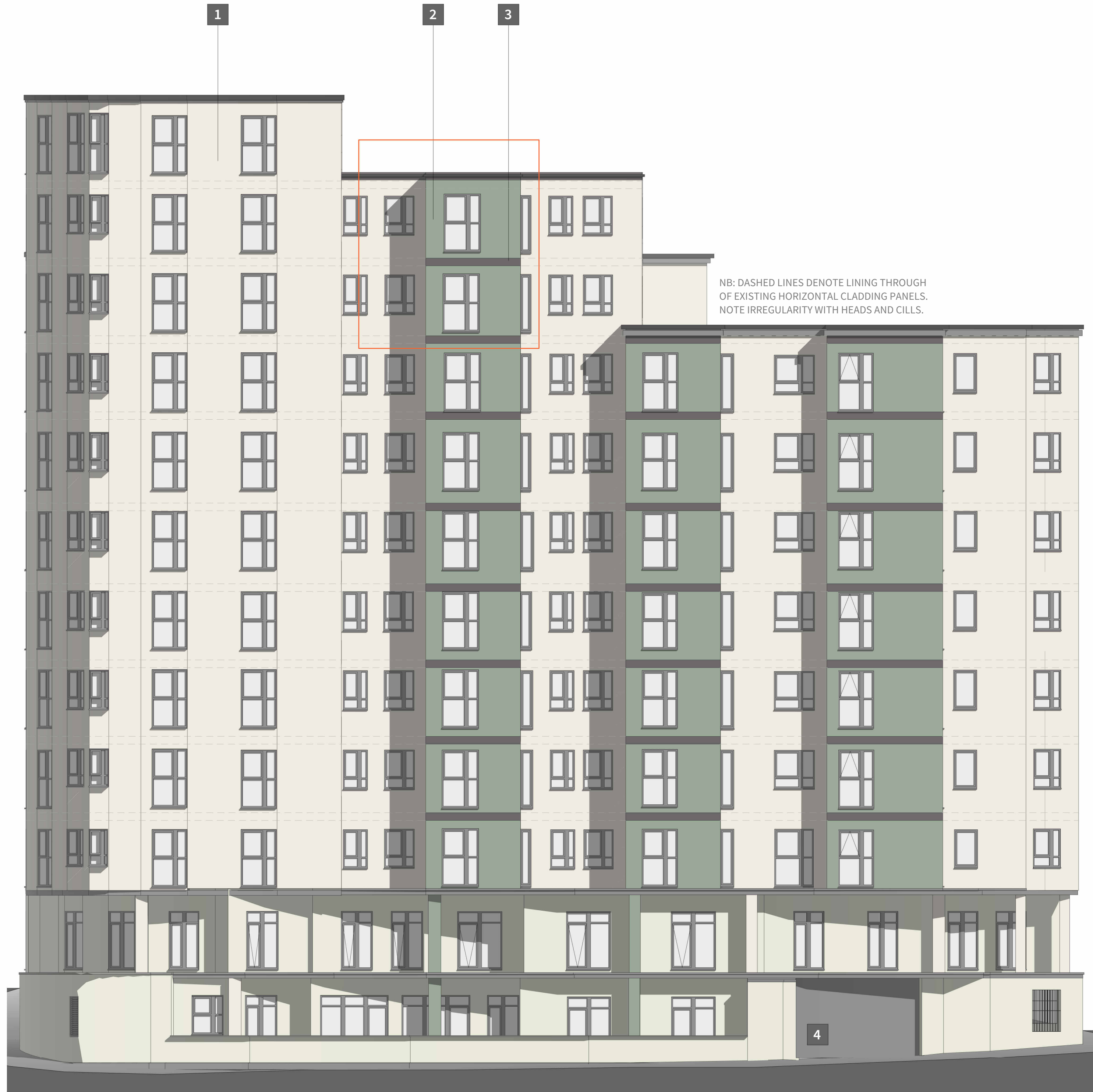
1 Existing Elevation - Burleigh St. 1:100