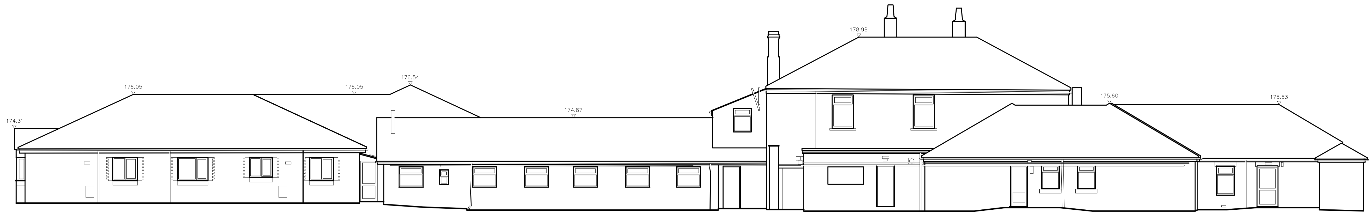
PROPOSED ELEVATION 3 SCALE 1:100