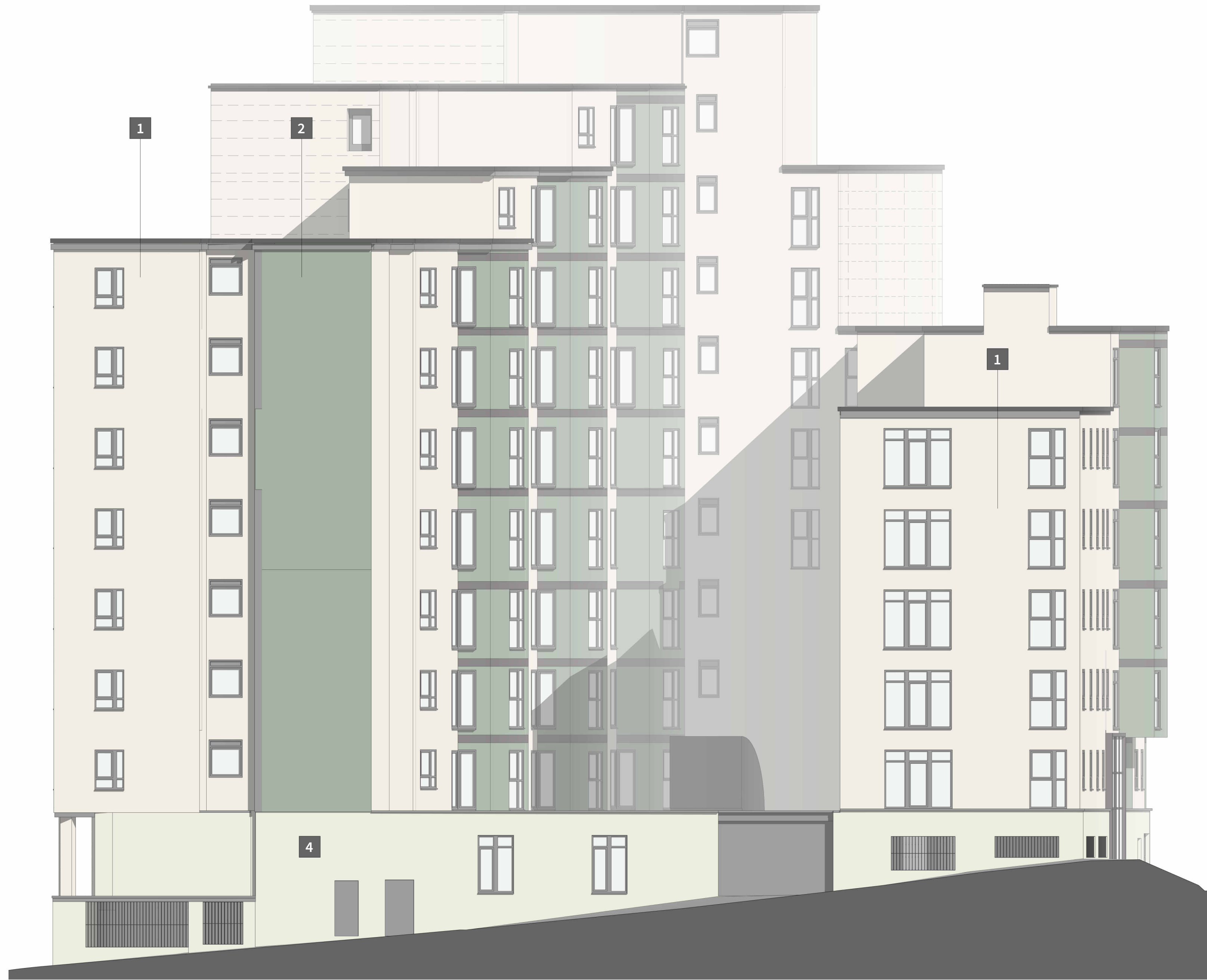
1 Existing_Elevation - John-St 1:100