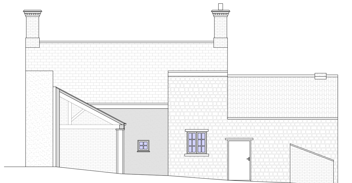
EXISTING SECTION B-B