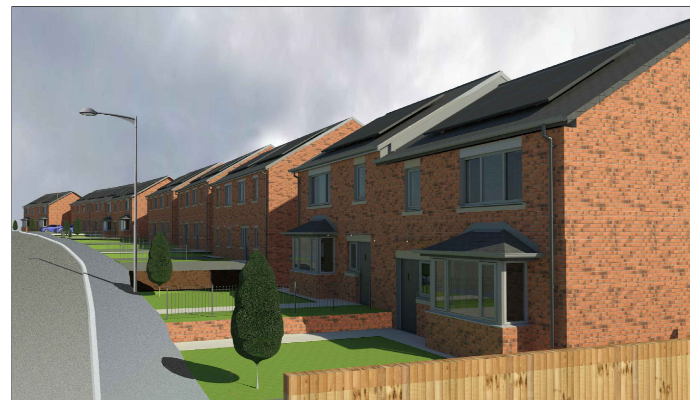
Street View 2

NOTES: This drawing is produced for use in this project only and may not be used for any other purpose. NPS Property Consultants Ltd accept no liability for the use of this drawing other than the purpose for which it was intended in connection with this project as recorded on the title block fields 'Purpose for Issue' and 'File Status Code'. This drawing may not be reproduced in any form without prior written agreement. Do not scale from the drawing, use written dimensions only.