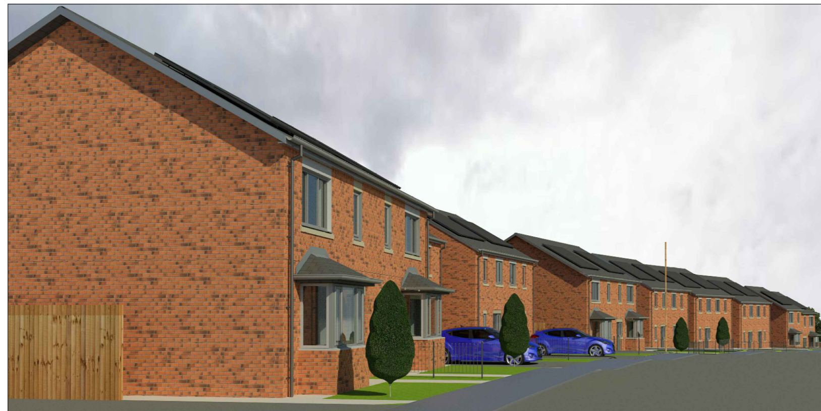
Street View 1