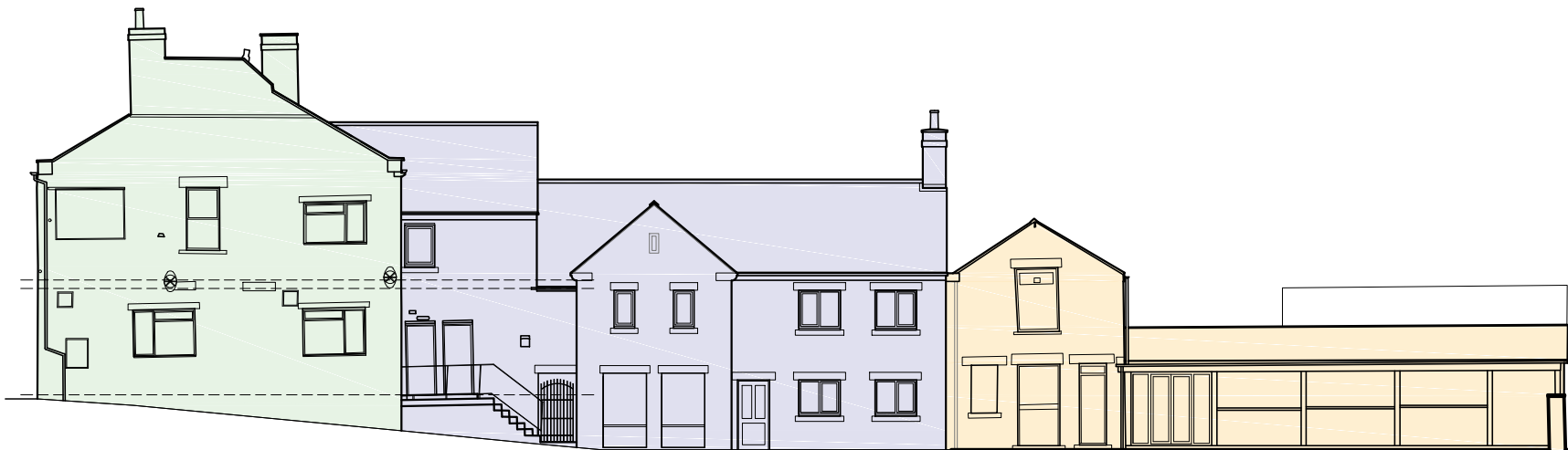
EXISTING NORTH ELEVATION 1/200 @ A3