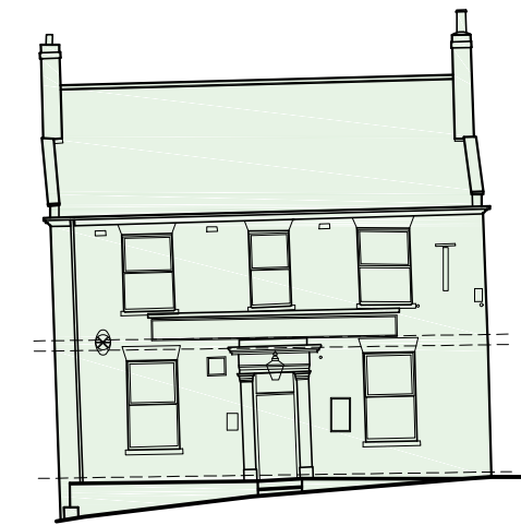
EXISTING FRONT ELEVATION 1/200 @ A3