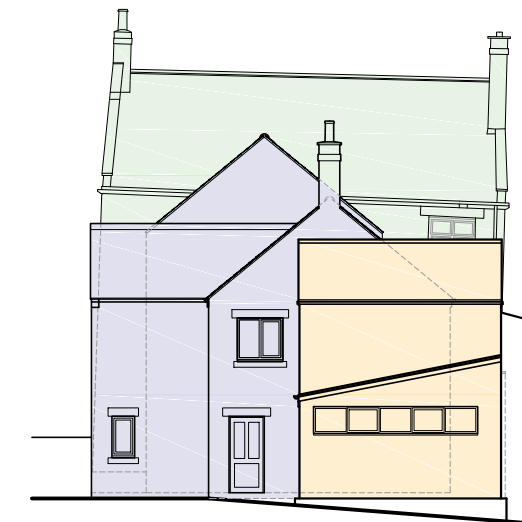
EXISTING REAR ELEVATION 1/200 @ A3