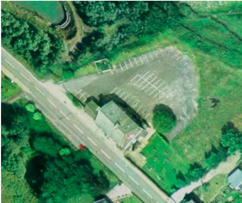
Aerial Photograph 2002 – Former Pratty Flowers Public House

To the rear of the site is allocated Green Belt land at a higher level with the boundaries defined by scrub, timber fencing and dry stone walls. There are two semi detached properties located adjacent to the proposed access, numbers 12 and 14 Pennine Edge.