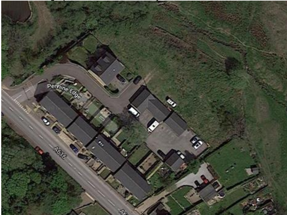
2020 Aerial Photograph of the site