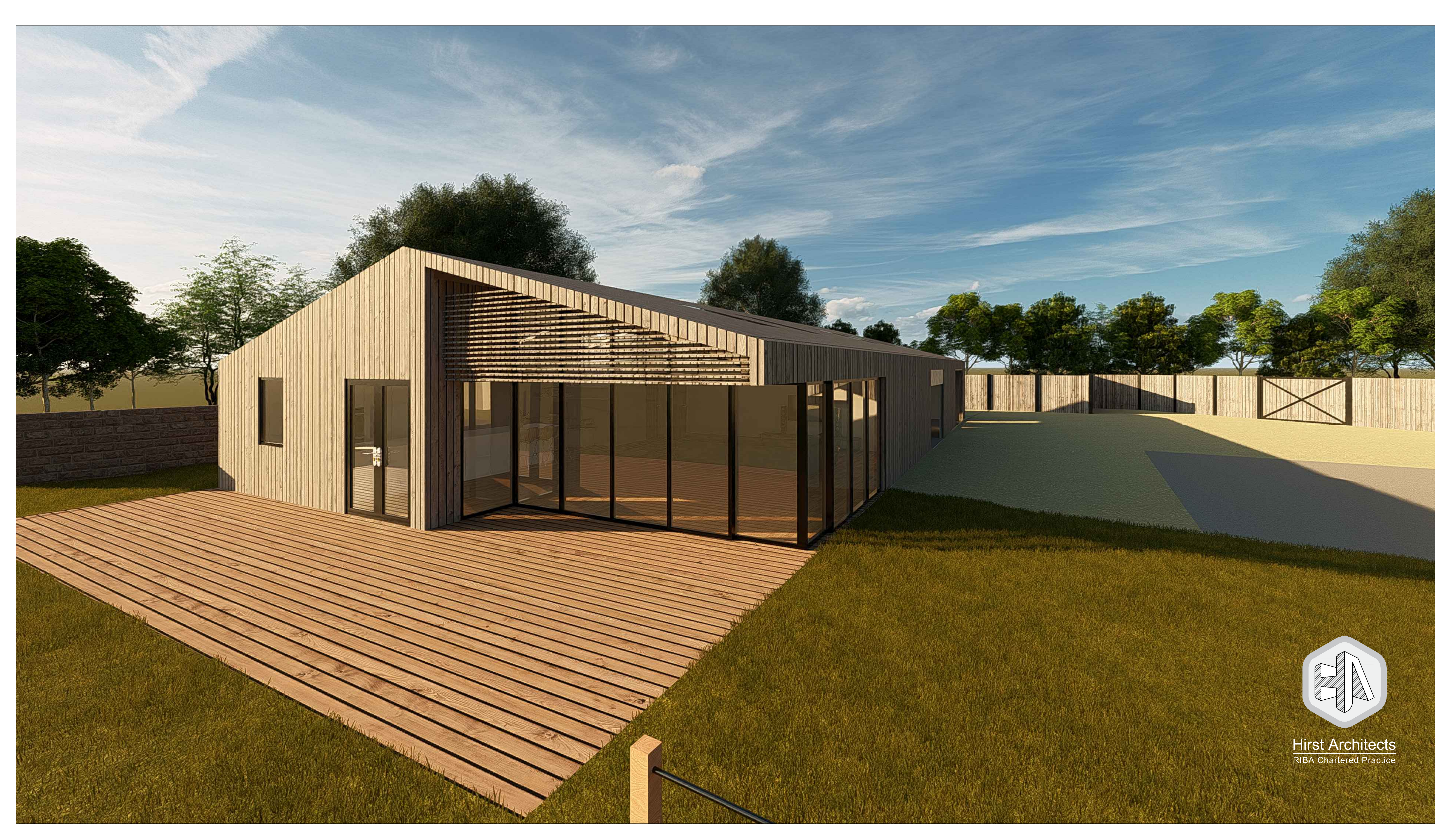
Proposed Architects CGI Visual Scale VARIES