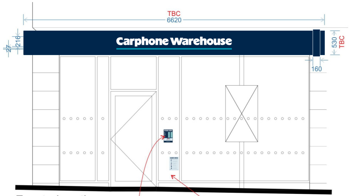
Front elevation Scale 1:100

'WE COMPARE' DIGITAL PRINT FORWARD APPLIED TO GLASS.