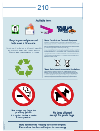
Reverse printed opening hours/store notices applied to glazing. Opening hours TBC. Scale 1:5