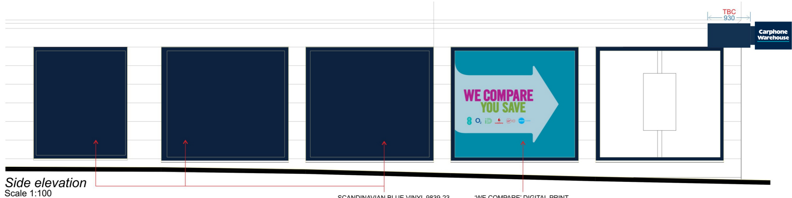
Side elevation Scale 1:100

SCANDINAVIAN BLUE VINYL 9839-23 FORWARD APPLIED TO GLASS.