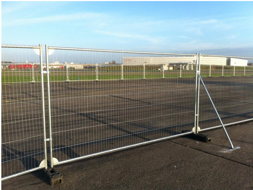
Figure 2: Secured 'Heras' type fencing with stabilizing system and anti-tamper couplers