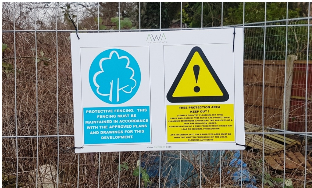
Figure 6: Example of A3 correx tree protection warning sign fixed to fencing panel