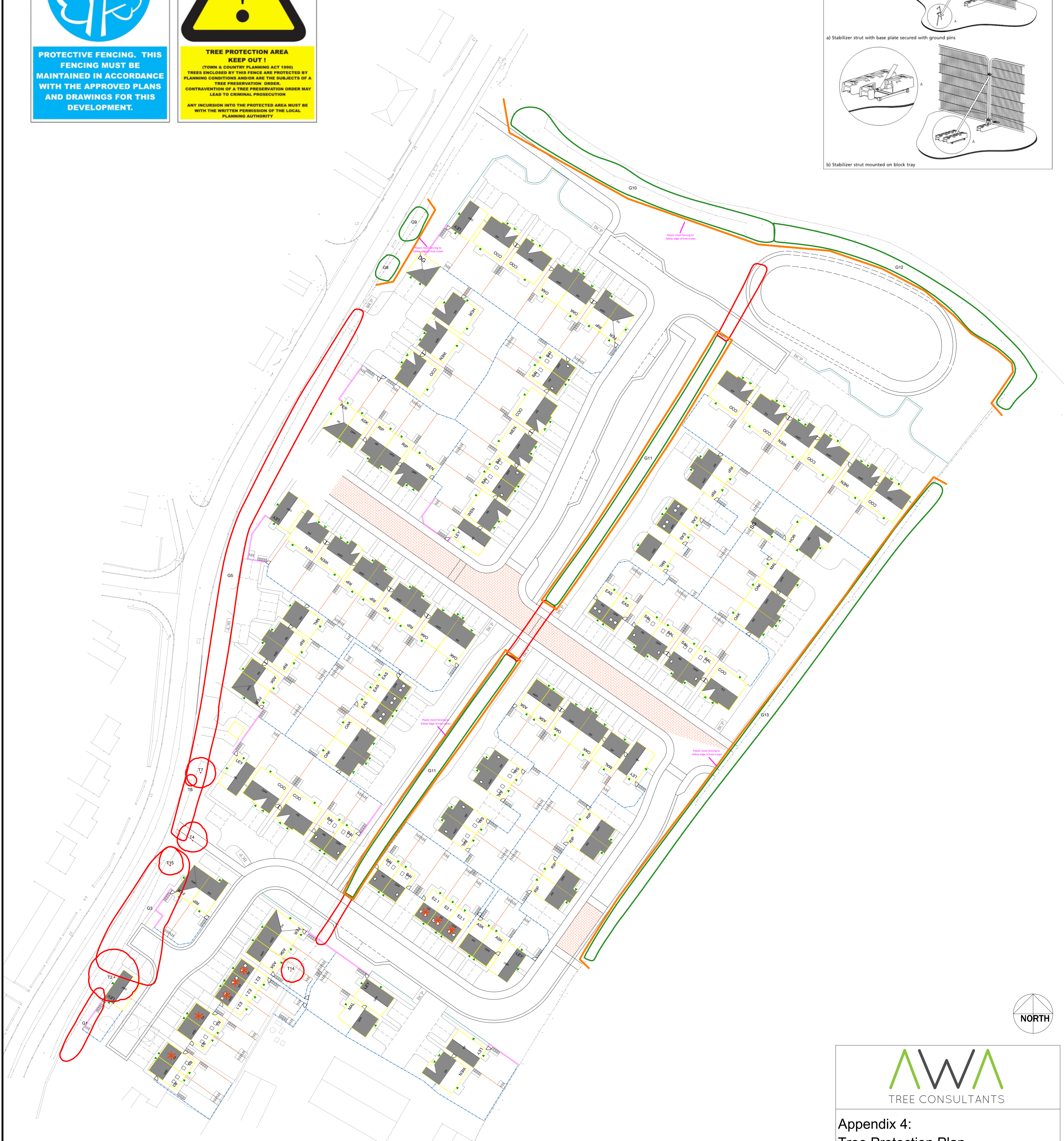
Heras tree protection fencing