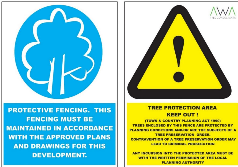
Figure 5: Warning sign for fencing