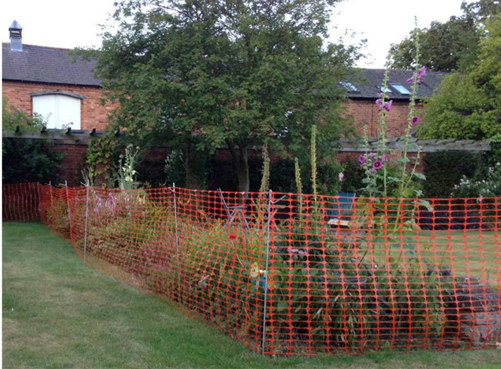
Figure 1: Plastic mesh fencing secured with heavy duty metal stakes