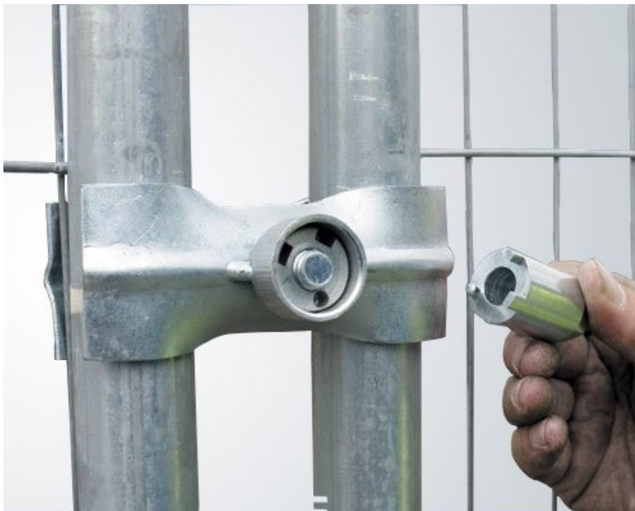
Figure 4: Anti-tamper couplers to secure fencing and avoid unauthorised access