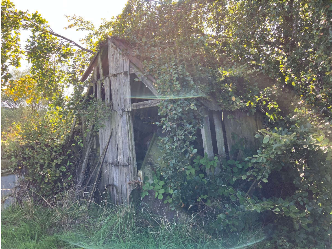
03. Outbuilding No 9