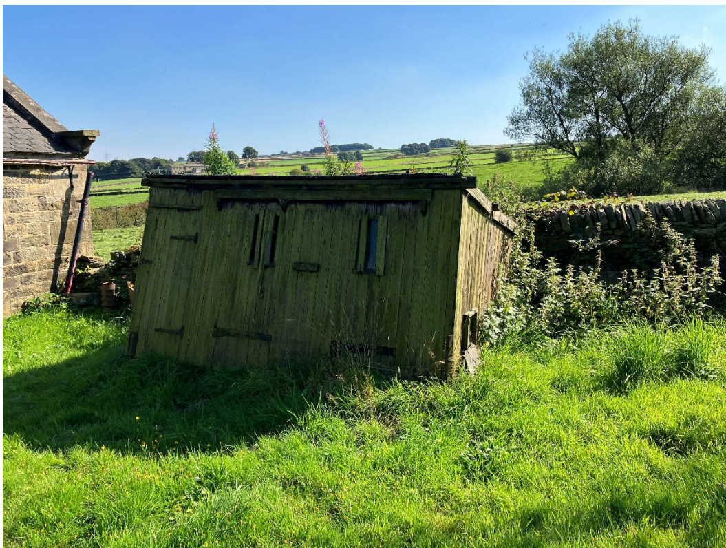
04. Outbuilding No 9A