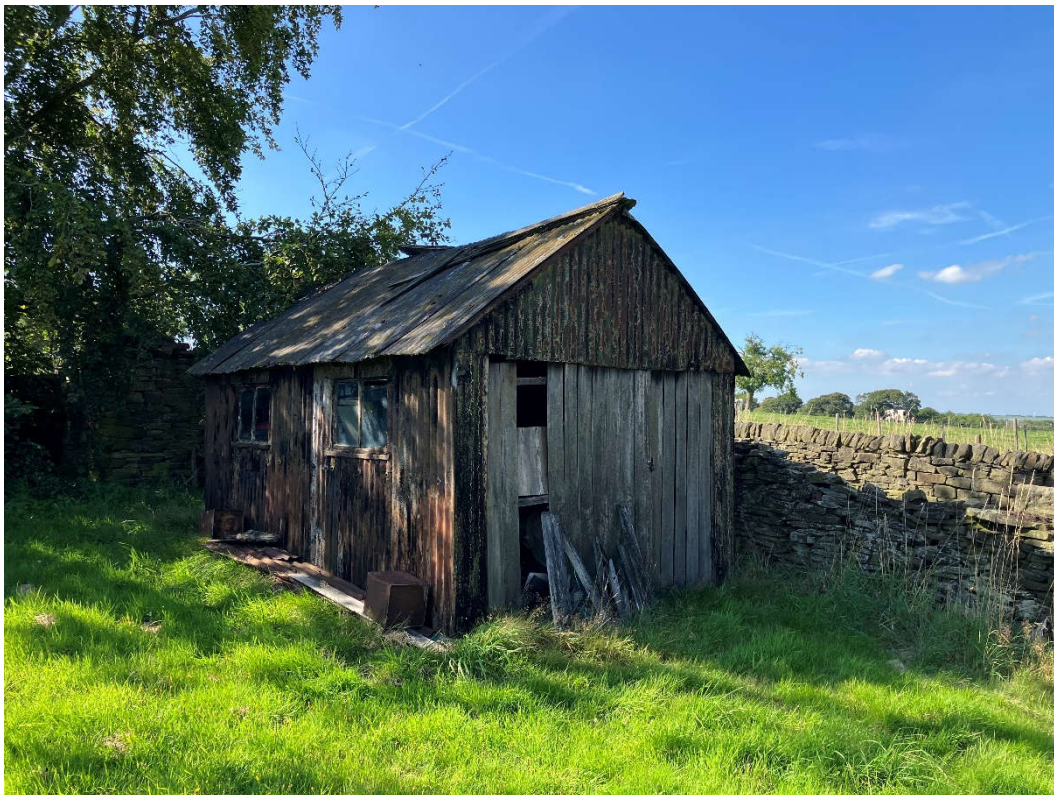
02. Outbuilding No 8