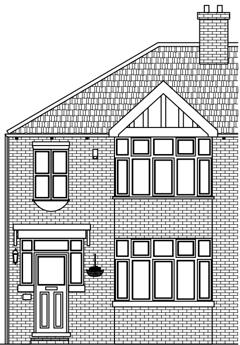
EXISTING FRONT ELEVATION SCALE 1:100 AT A3