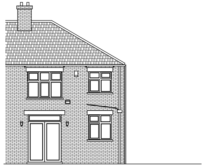
EXISTING REAR ELEVATION SCALE 1:100 AT A3