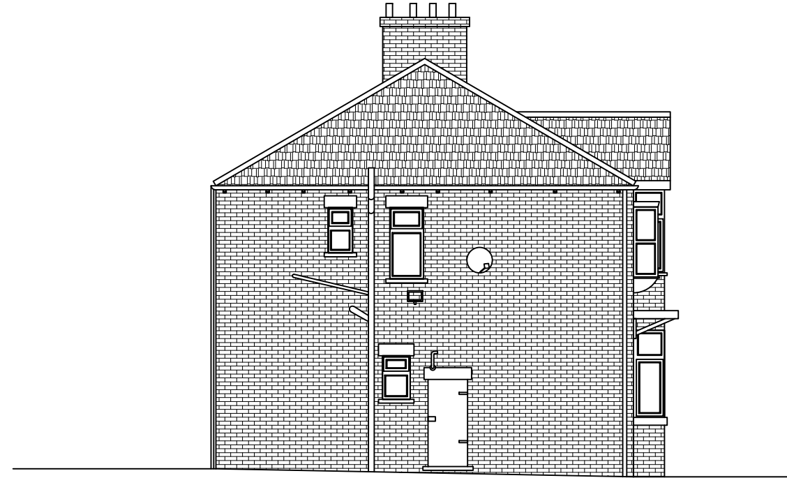
EXISTING END ELEVATION SCALE 1:100 AT A3