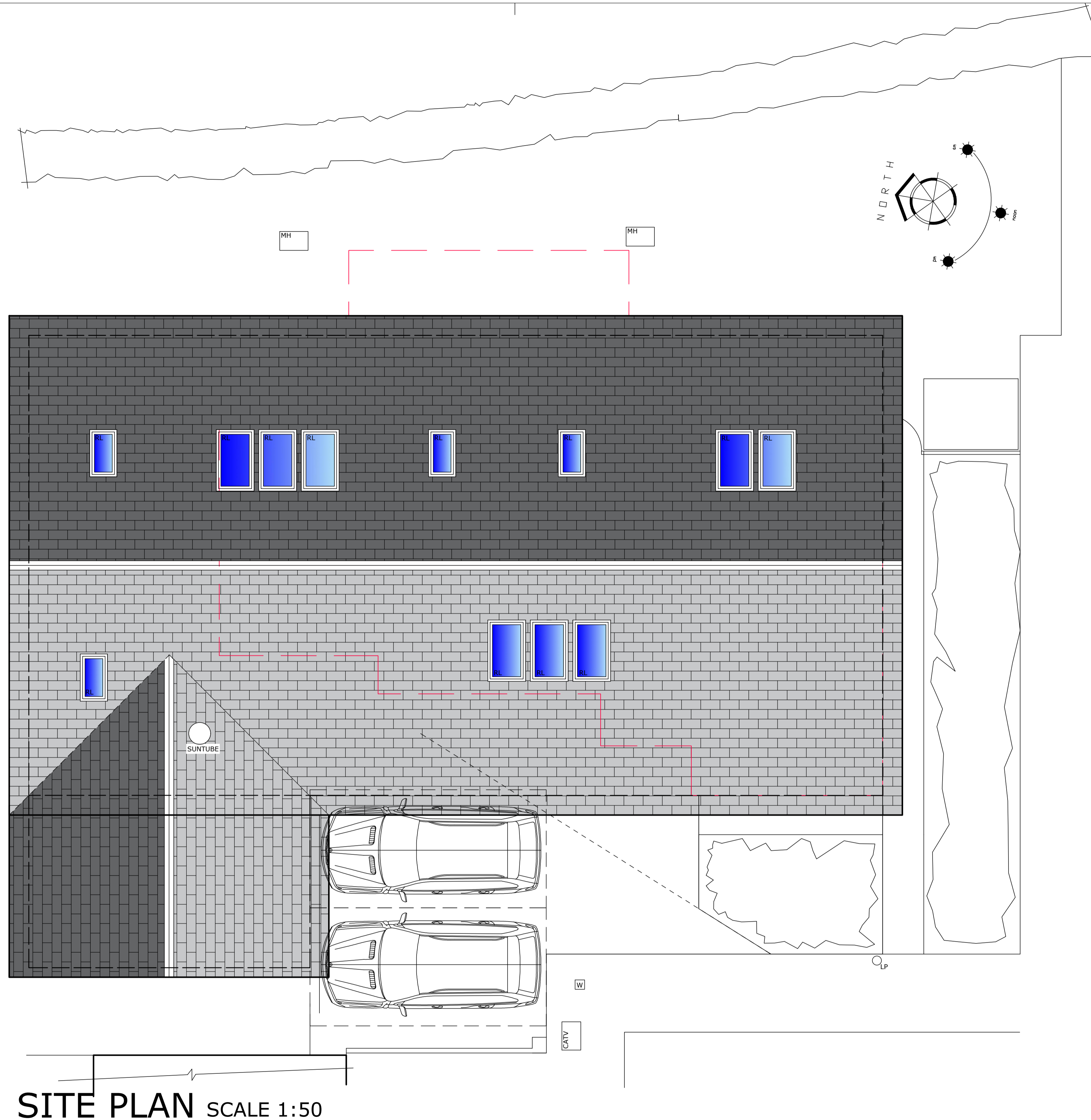
SITE PLAN SCALE 1:50