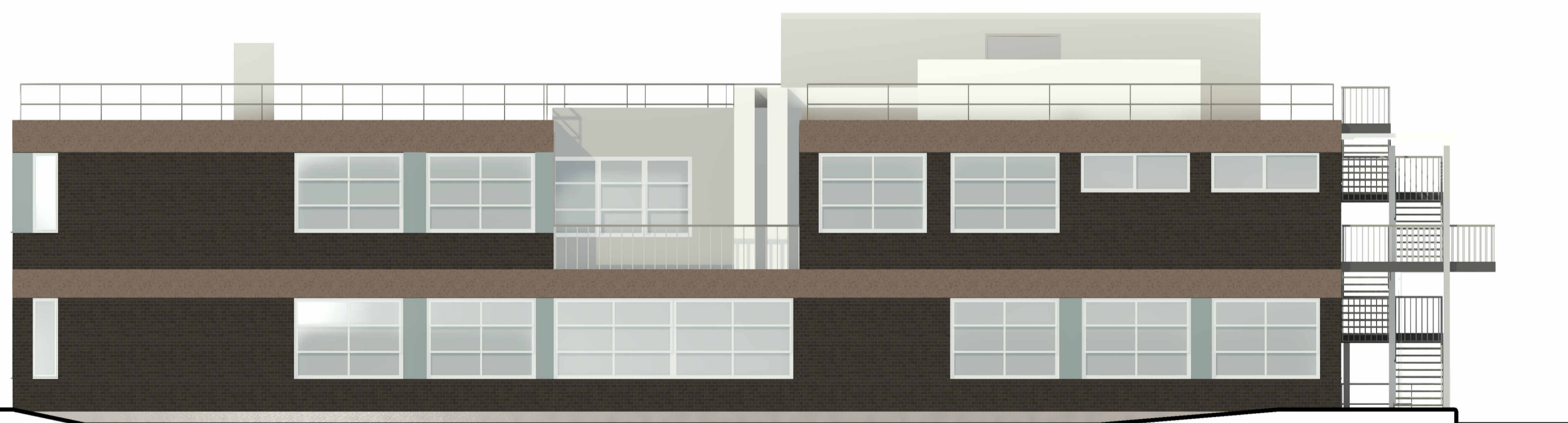
Existing - South West