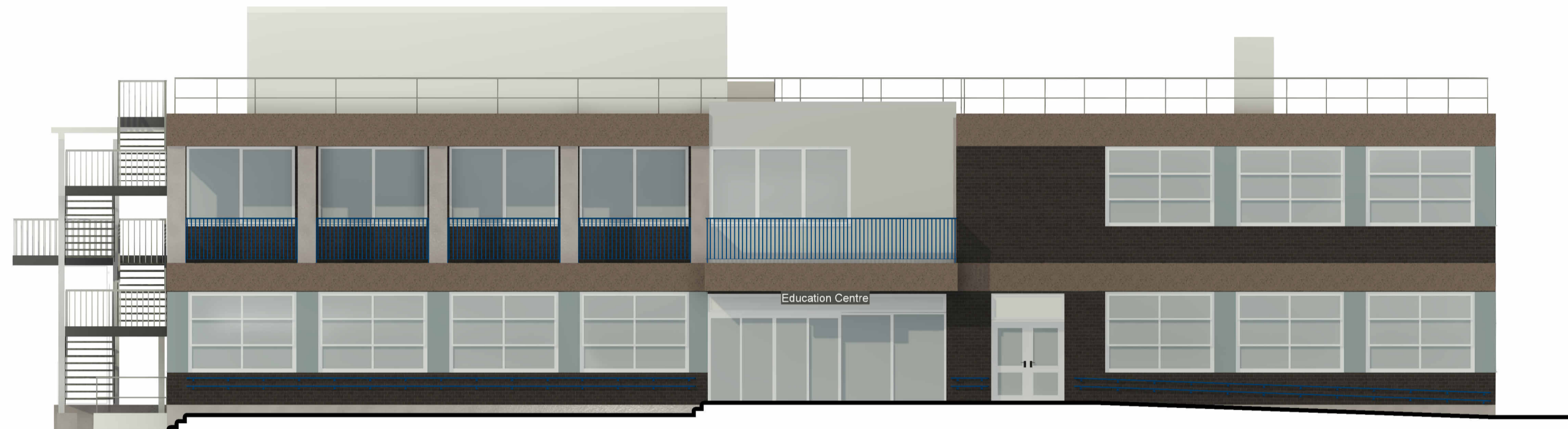
Existing - North East