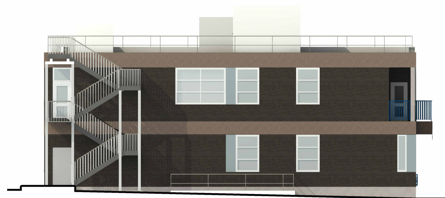
Existing - South East