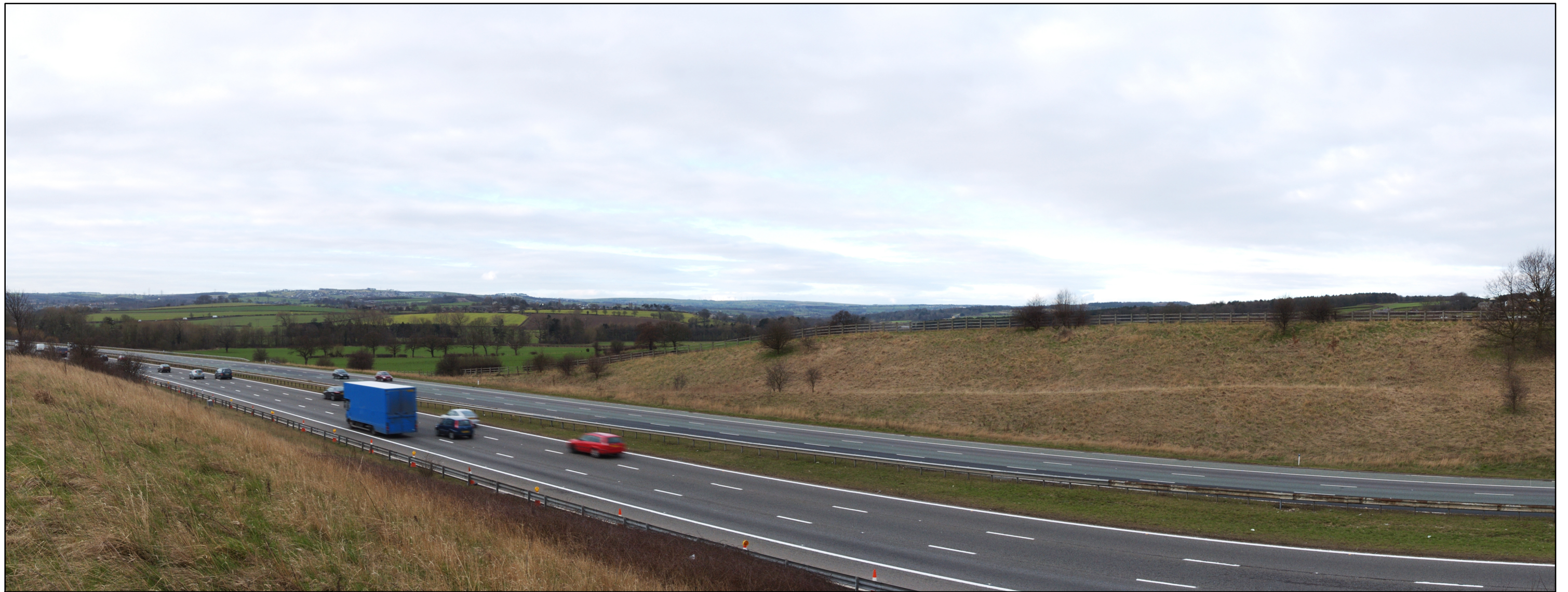
Existing view from viewpoint