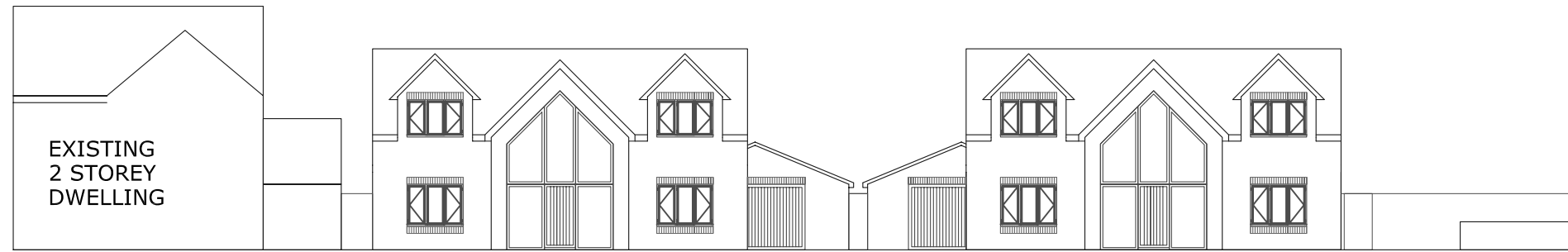
PROPOSED STREET SCENE TO NEWLANDS AVENUE