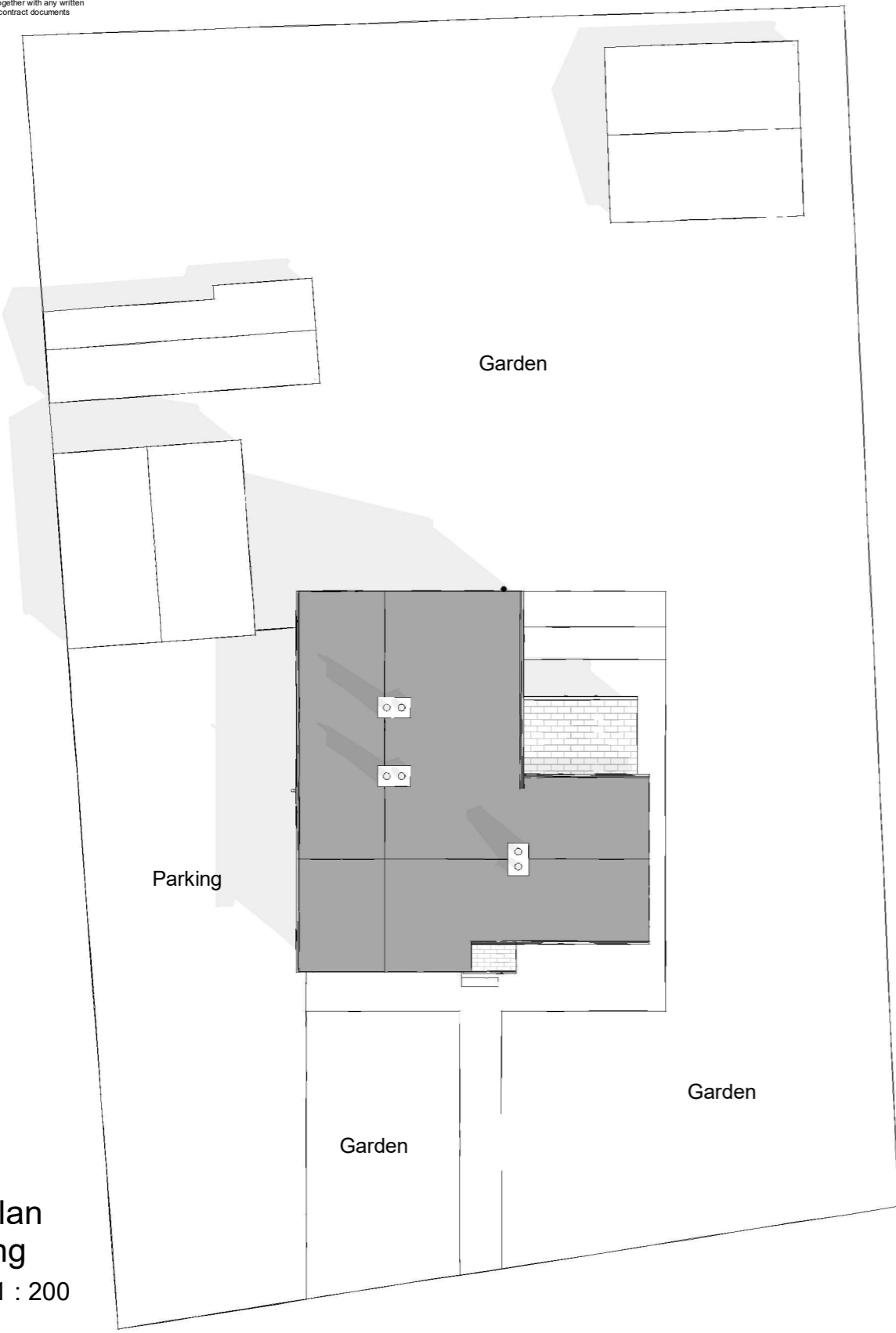
Site Plan Existing Scale 1 : 200