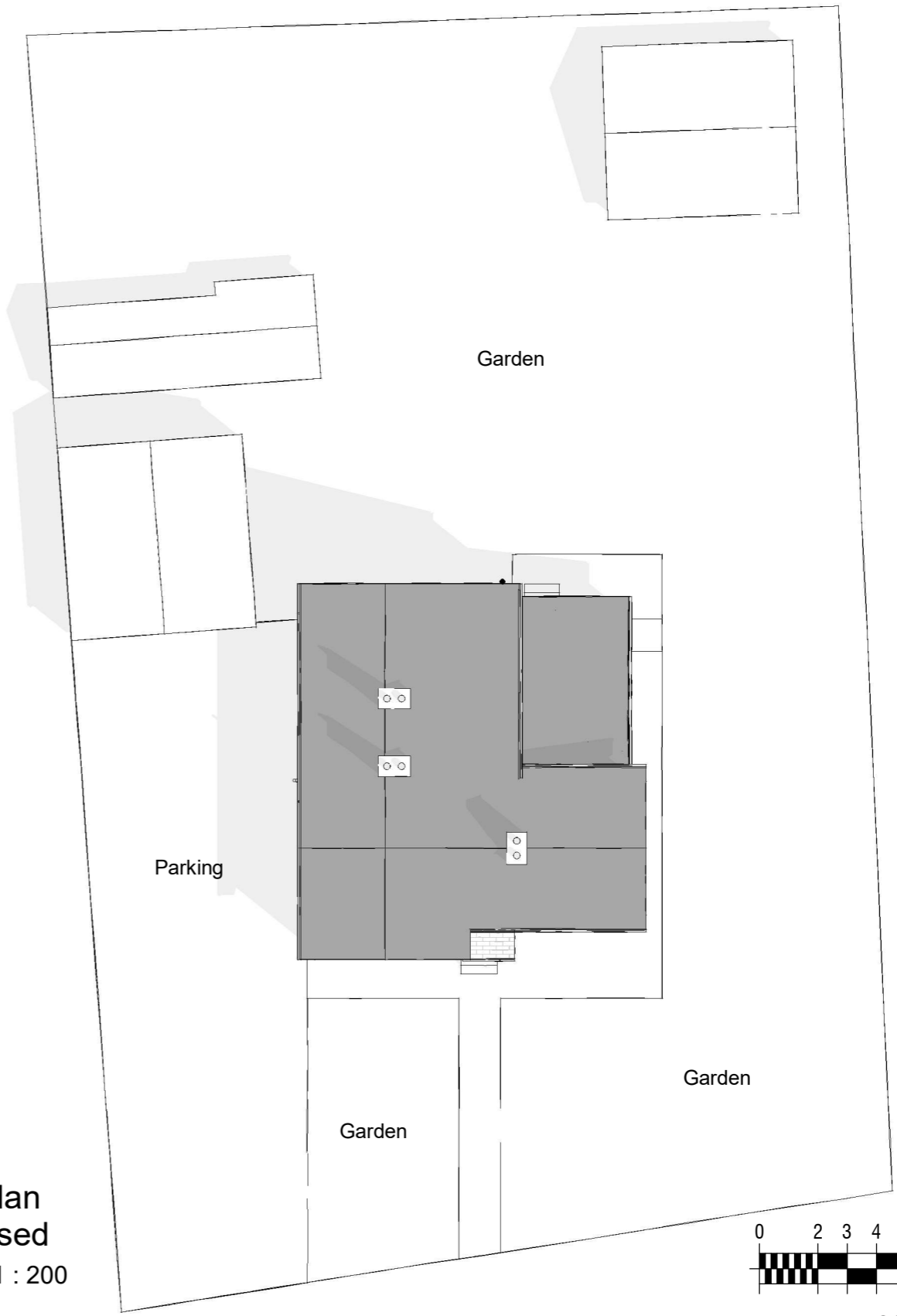
Site Plan Proposed Scale 1 : 200