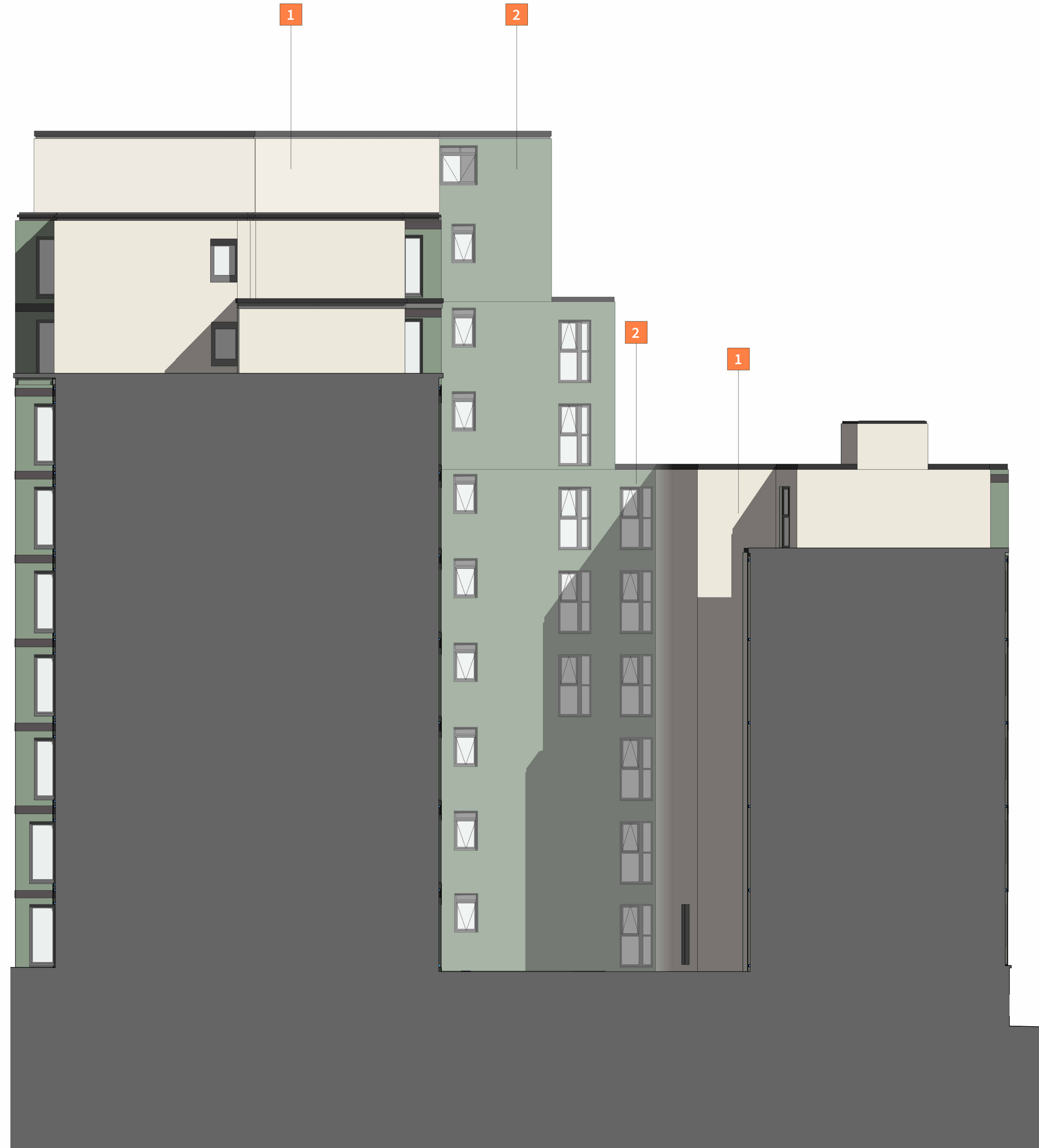
2 Proposed_Elevation - Courtyard B 1:100

NB: REFER TO DRAWINGS, 23-021_FA-DR-200 AND 23-021_FA-DR-201 FOR FURTHER REFERENCE TO EXISTING AND PROPOSED ELEVATION DETAILS.