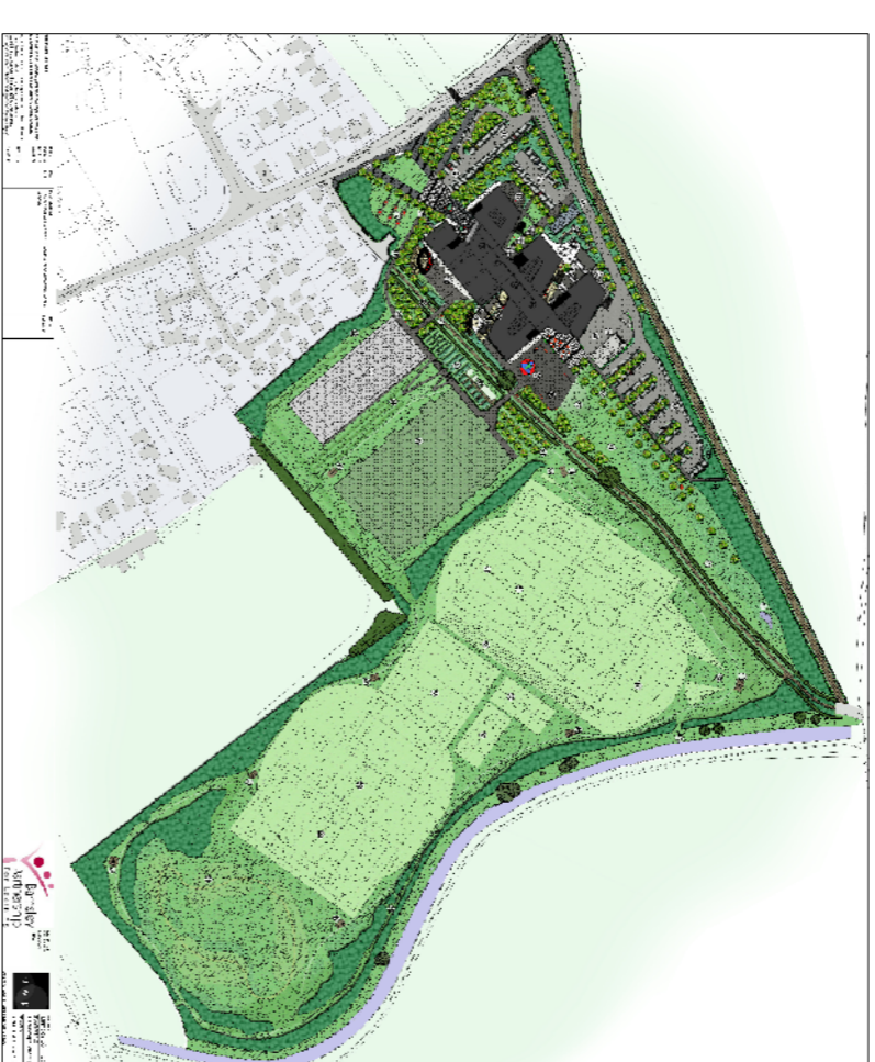
Proposed Landscape Masterplan - NTS