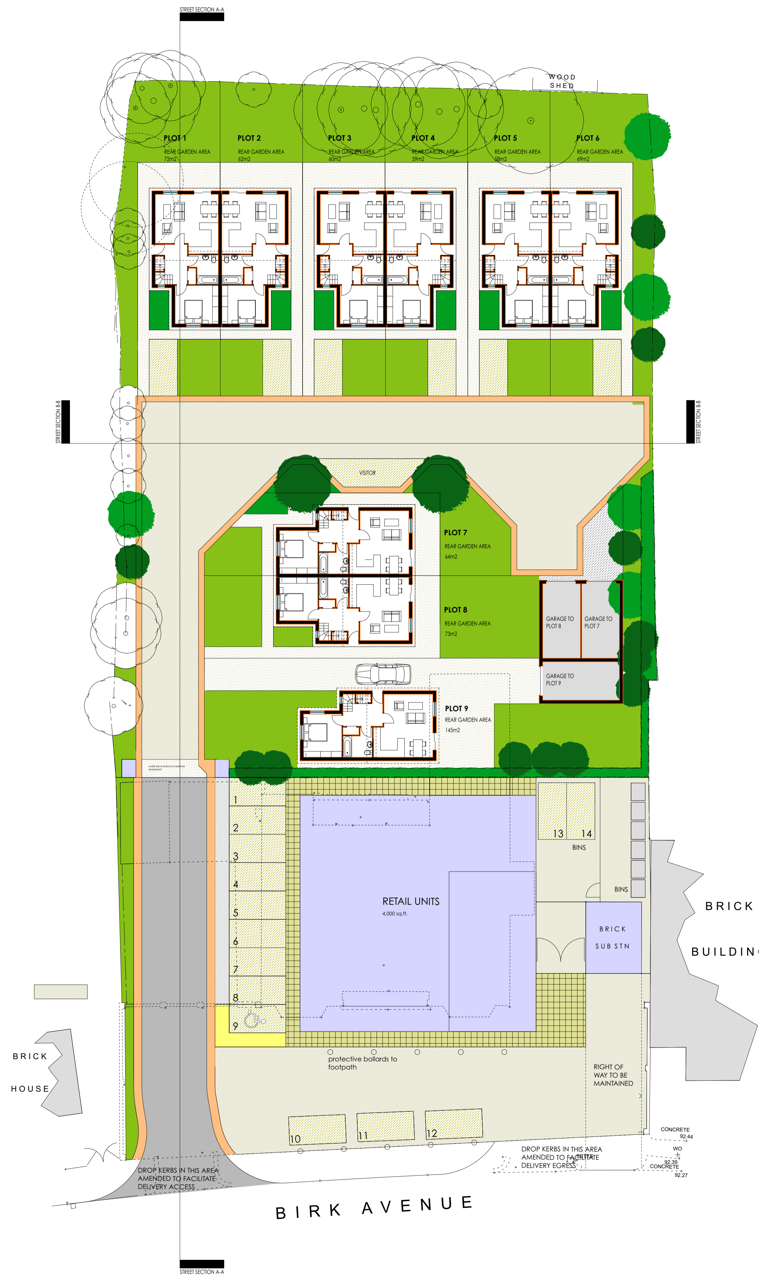
1:200 Site Plan as Proposed