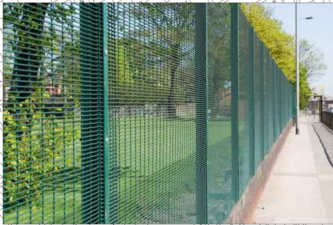
2.4m high Paladin (weldmesh) Fencing Dark Green RAL.6005, to boundary