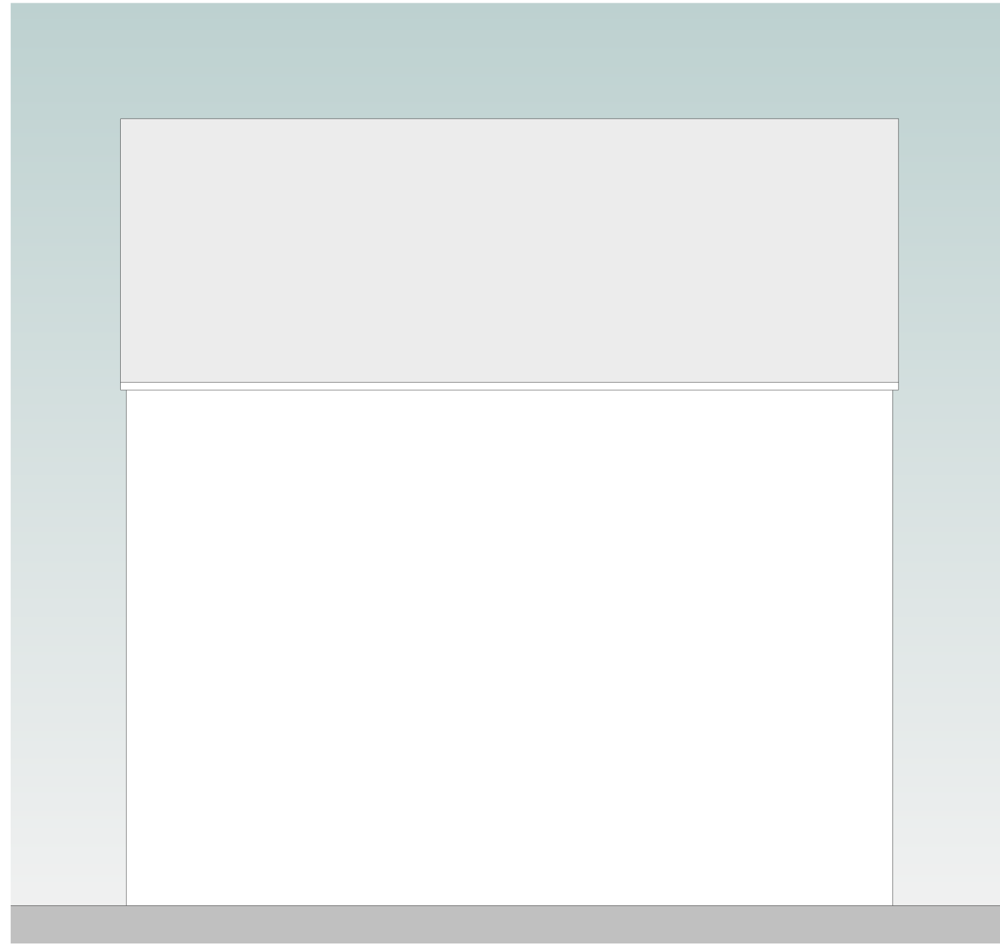
Side 2 Elevation