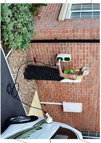
Location of EVC Point- Specification EV/Electric Vehicle Charging Unit - Type 2 Socket - 32 Amp (7.2kW) - IP55 - Suitable for all cars