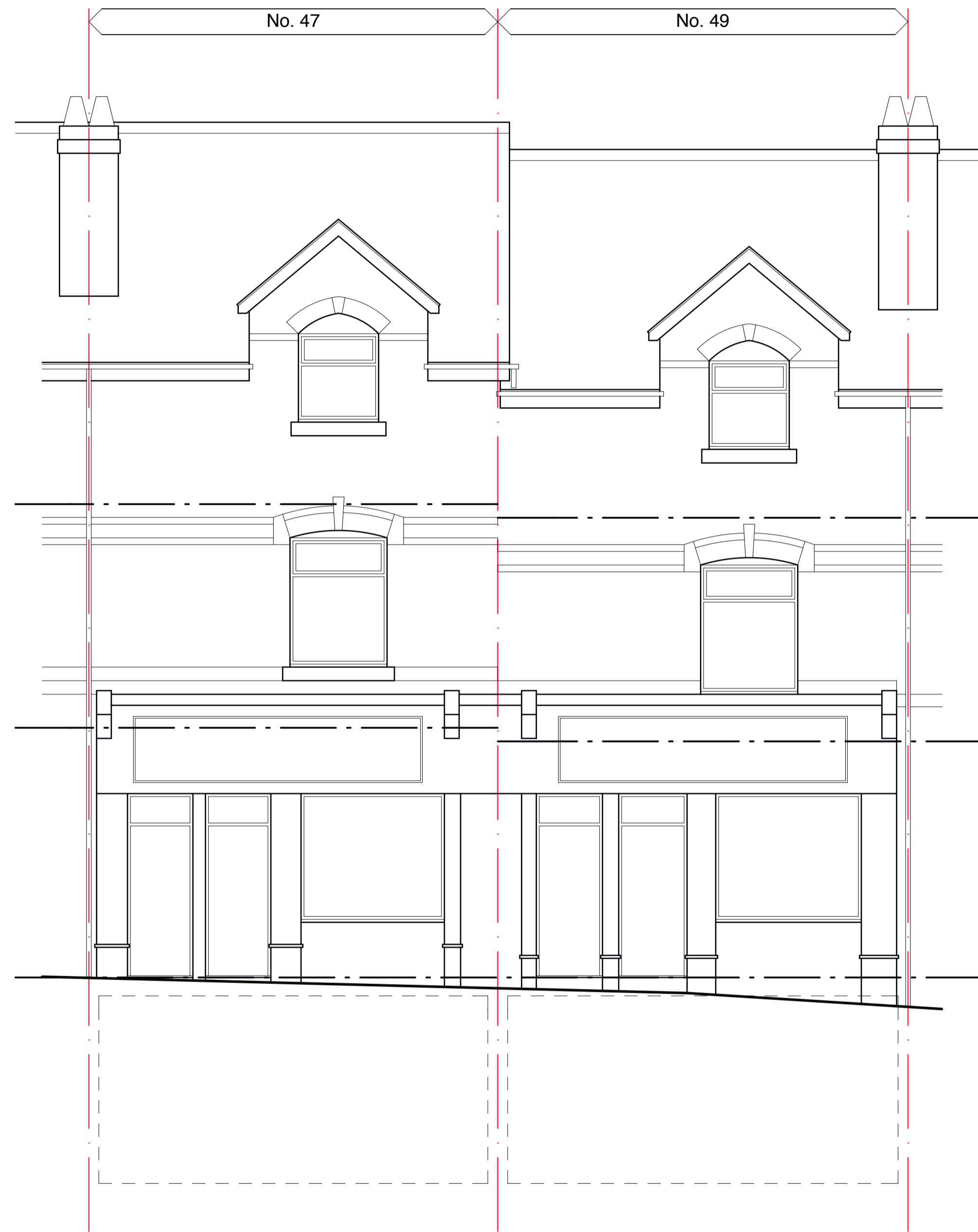
EXISTING PARK ROAD / FRONT ELEVATION