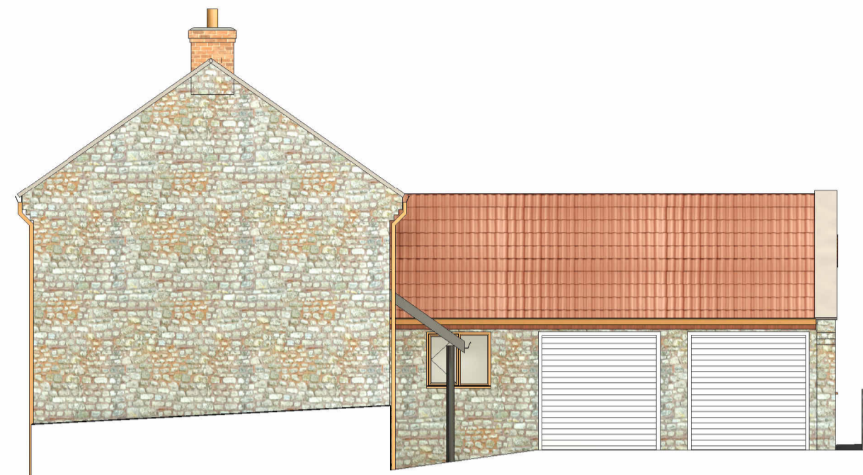
2 Existing Side Elevation 1 : 100