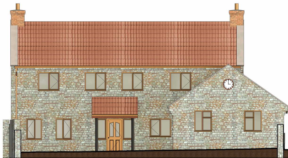
3 Existing Rear Elevation 1 : 100