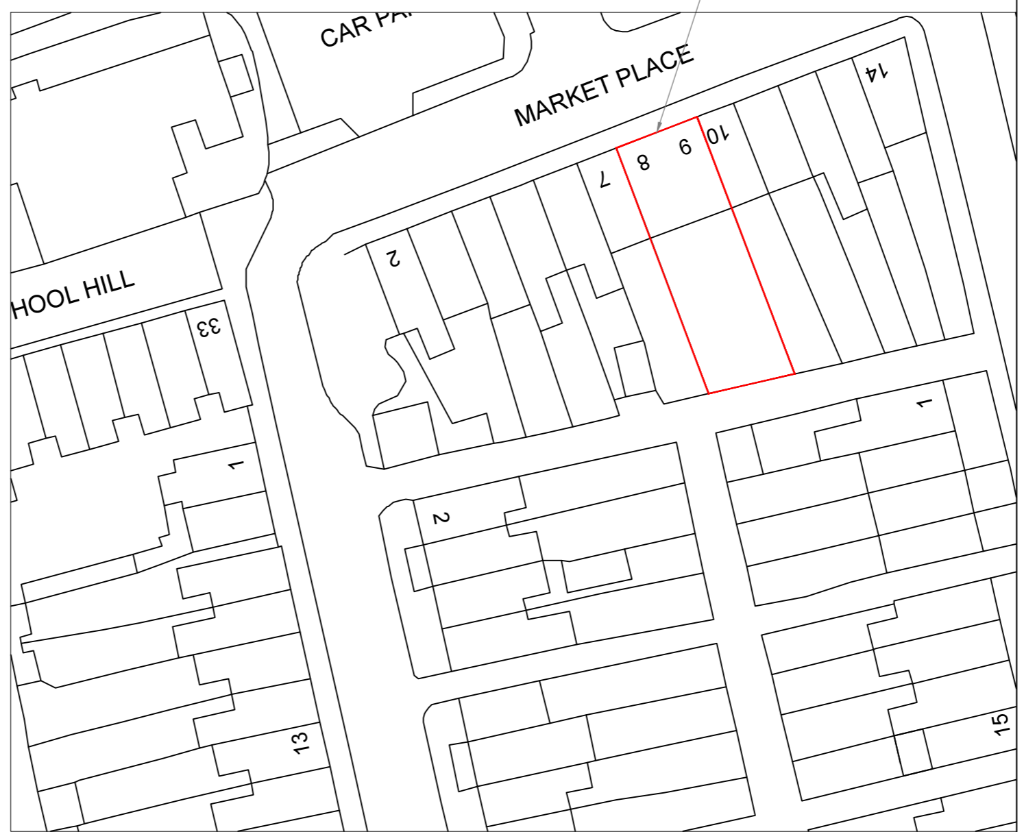
SITE PLAN SCALE 1:500 AT A3