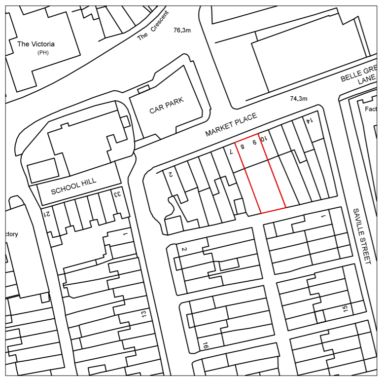
LOCATION PLAN SCALE 1:1250 AT A3