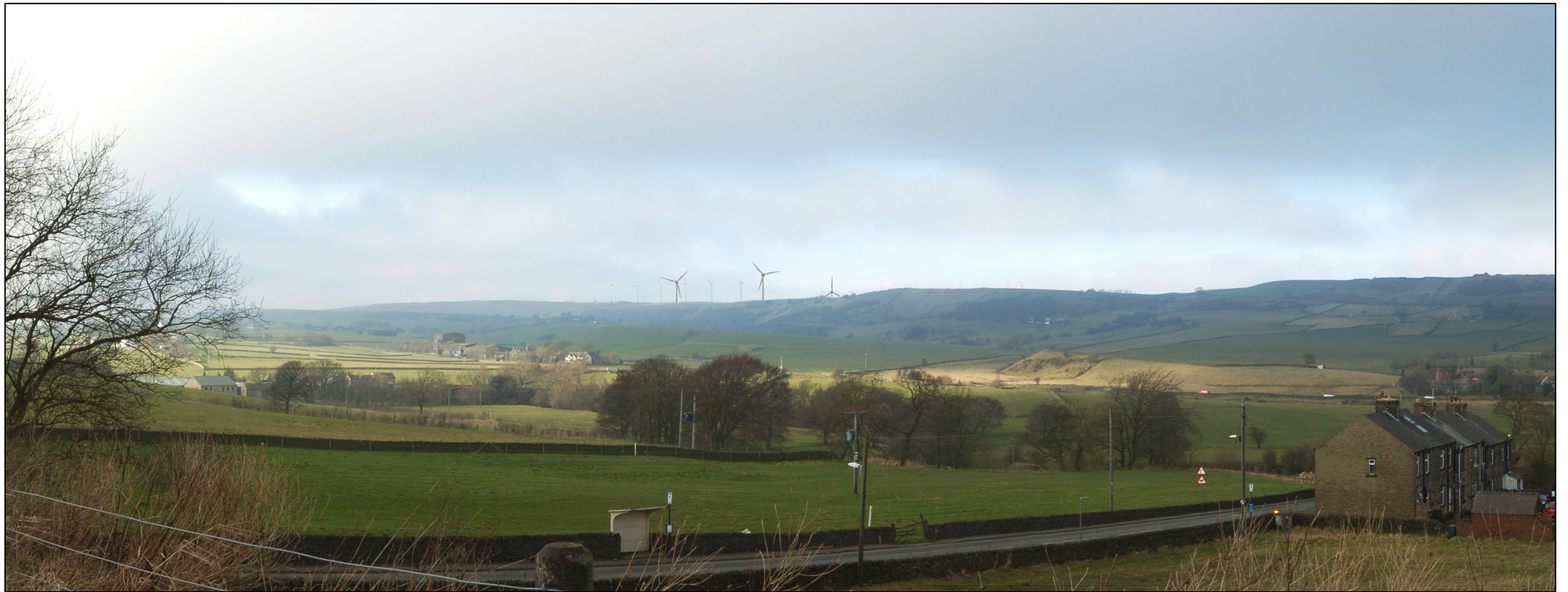
Photomontage showing proposed development from viewpoint