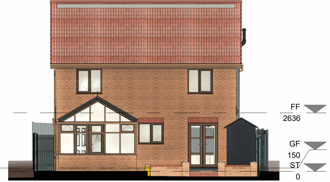
5 Existing East Elevation 1 : 100