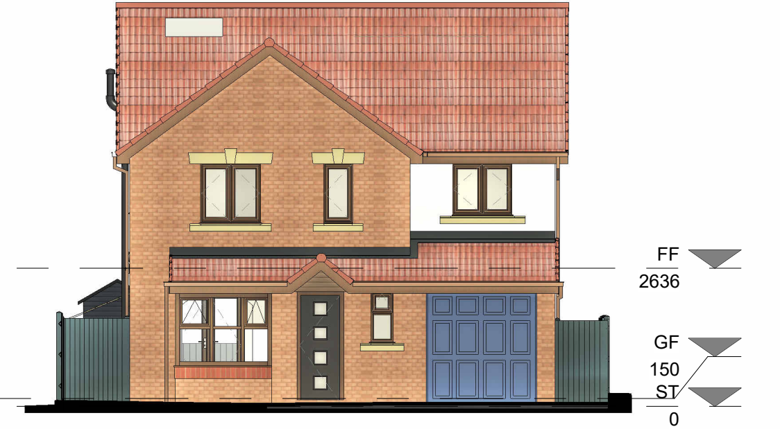
7 Existing West Elevation 1 : 100