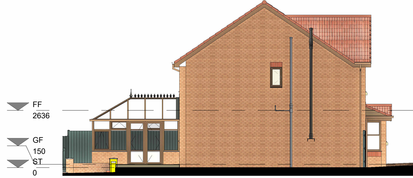
4 Existing North Elevation 1 : 100