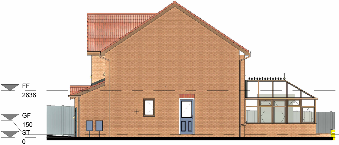
6 Existing South Elevation 1 : 100