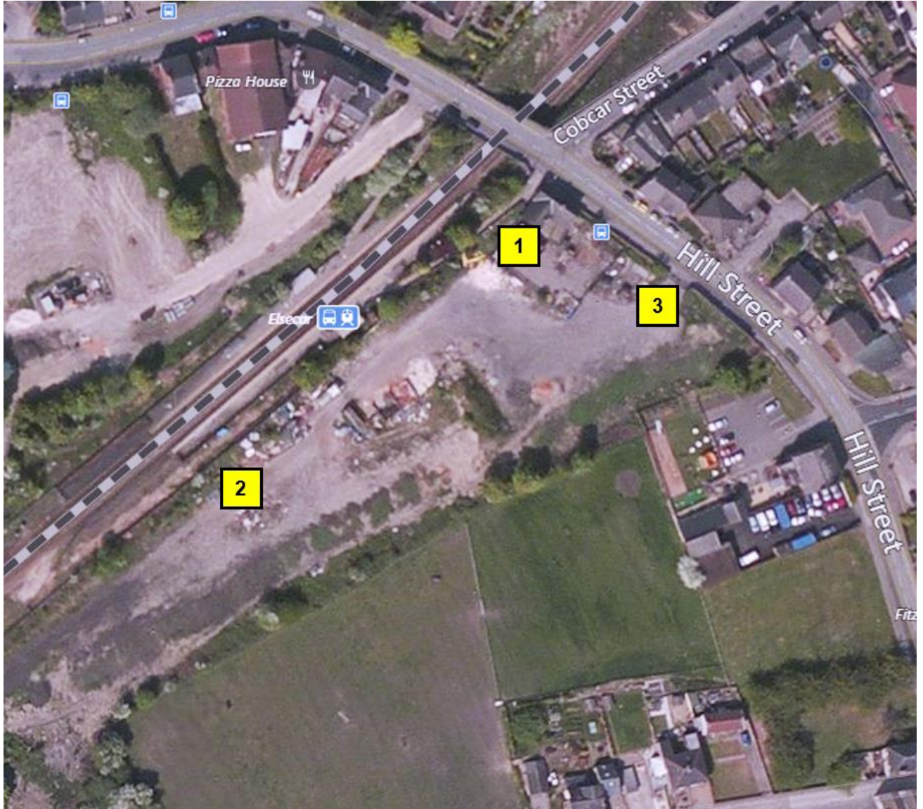
FIGURE 1 – SITE AERIAL VIEW AND APPROXIMATE MEASUREMENT LOCATIONS