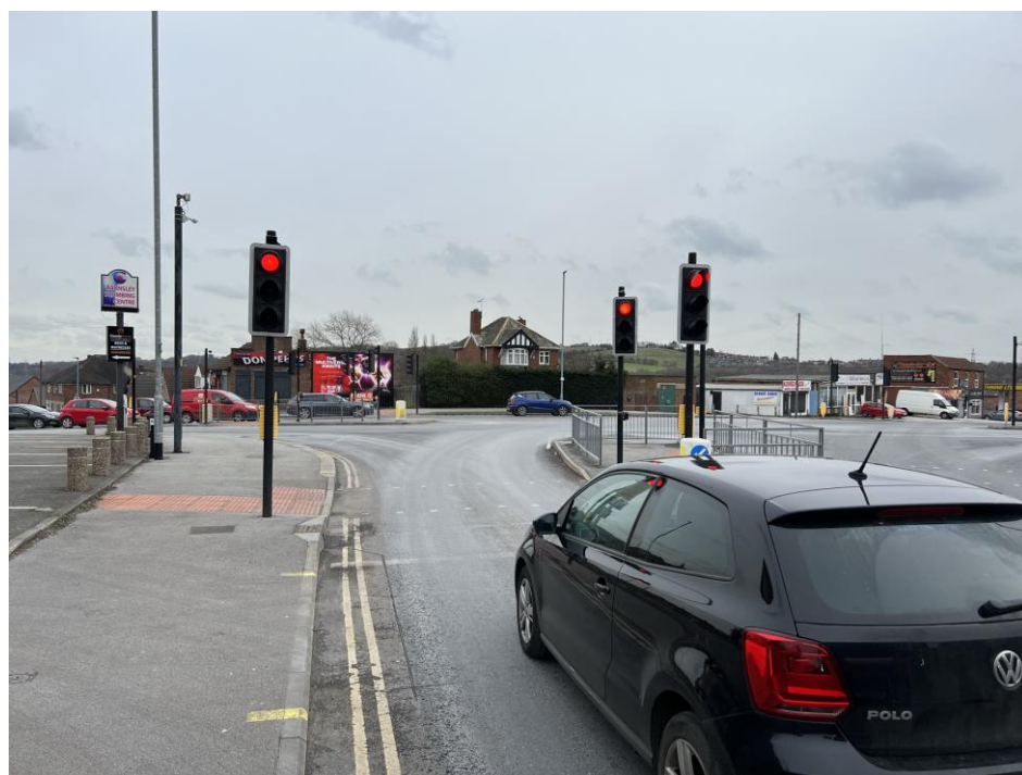
Fig 1: Ref. No 2020/1059 – Land at Grange Lane Barnsley S71 5QQ - Consent for 1 x 48 sheet digital advertisement – Allowed on Appeal on 08/06/2021(Appeal Ref. APP/R4408/Z/21/3266528)

It is considered that the above example of a consented 48 sheet illuminated display is directly comparable to the application proposal, as the site lies within the same locality as the application site,