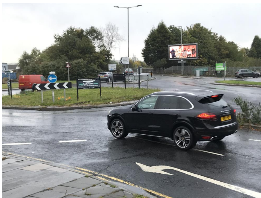
Fig 4: Land at St. Ann's Road c/o Erskine Road Rotherham S65 1RQ - Consent for 1 x 48 sheet freestanding digital advertisement – Allowed on Appeal on 28/07/2020 (Appeal Ref. APP/P4415/Z/20/3252133).

The above site photo clearly shows the example of a consented 48 sheet digital display viewed against the backdrop of well-established trees, which provide greenery around the digital display.