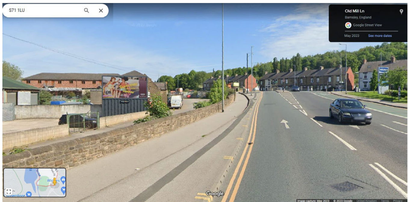
Fig 2: Ref. No 2021/0879 - Land and Buildings to the west of Peel Place and Old Mill Lane, Barnsley S71 1LU - Consent for 1 x 48 sheet digital advertisement – Allowed on Appeal on 09/03/2022 (Appeal Ref. APP/R4408/Z/21/3286423).

The consented site at the above site mirrors the application site in terms of size, scale and landscape orientation, and the same operational characteristics of digital illumination and static advert images displayed on a freestanding structure in an area of mixed use and large open scale.