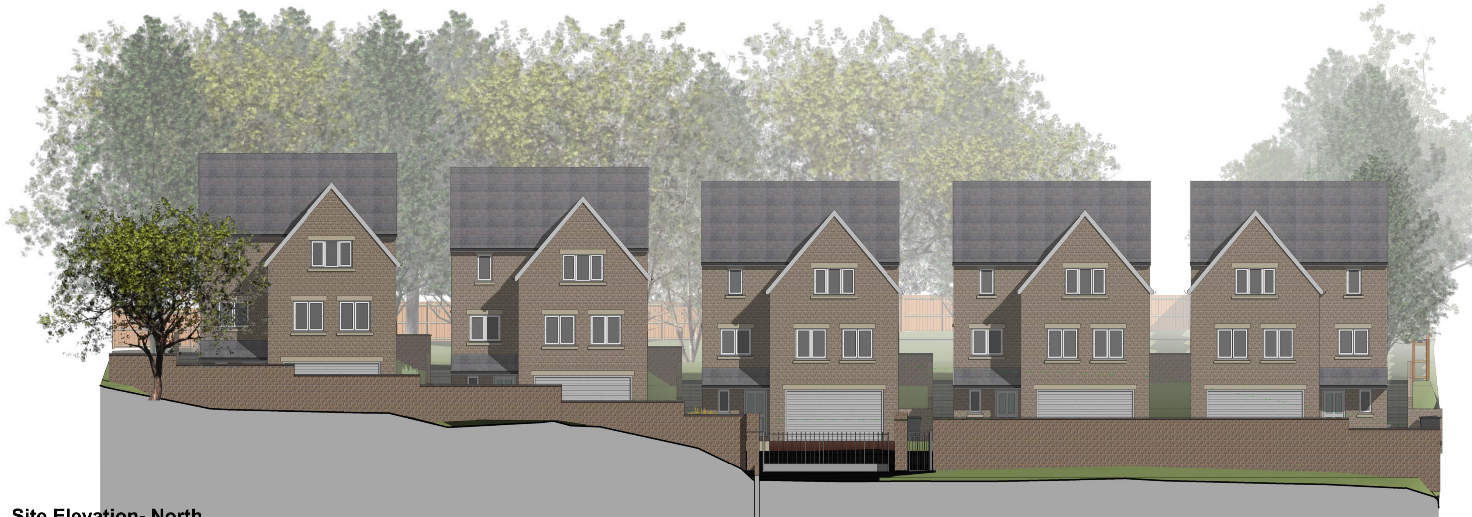
1 Site Elevation- North 1 : 100