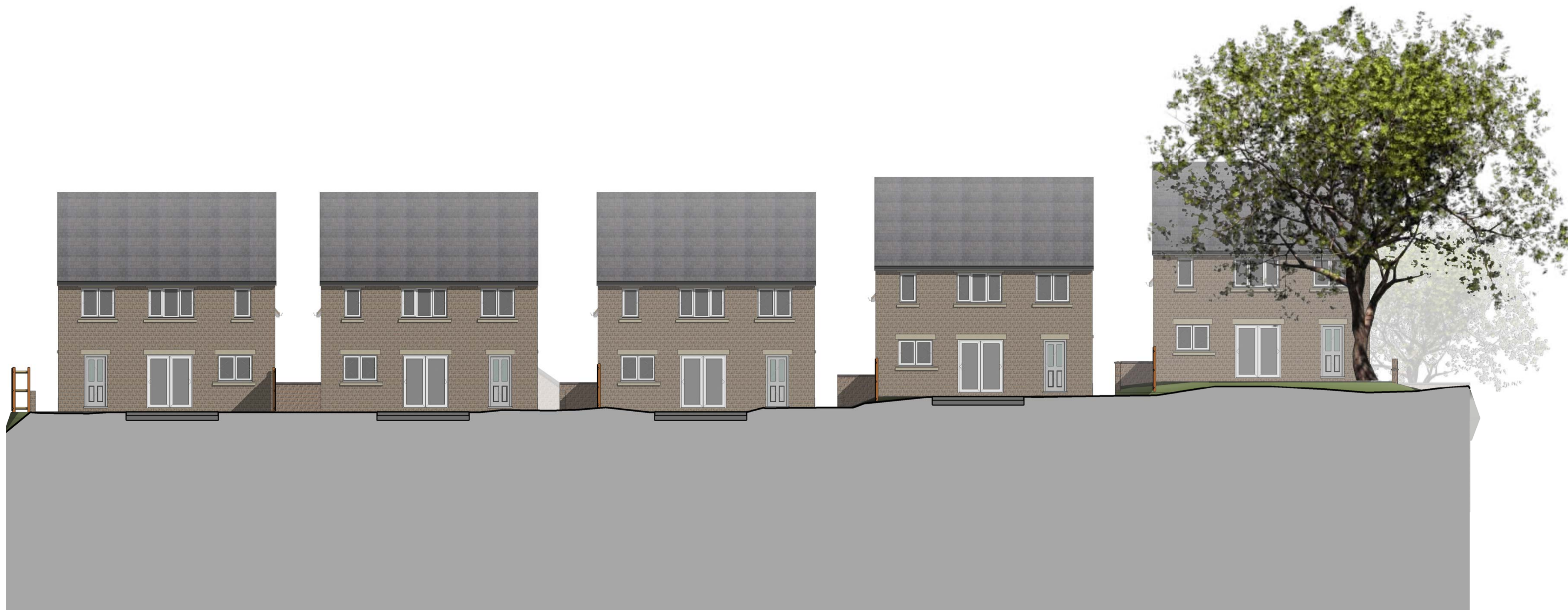
2 Site Elevation- South 1 : 100