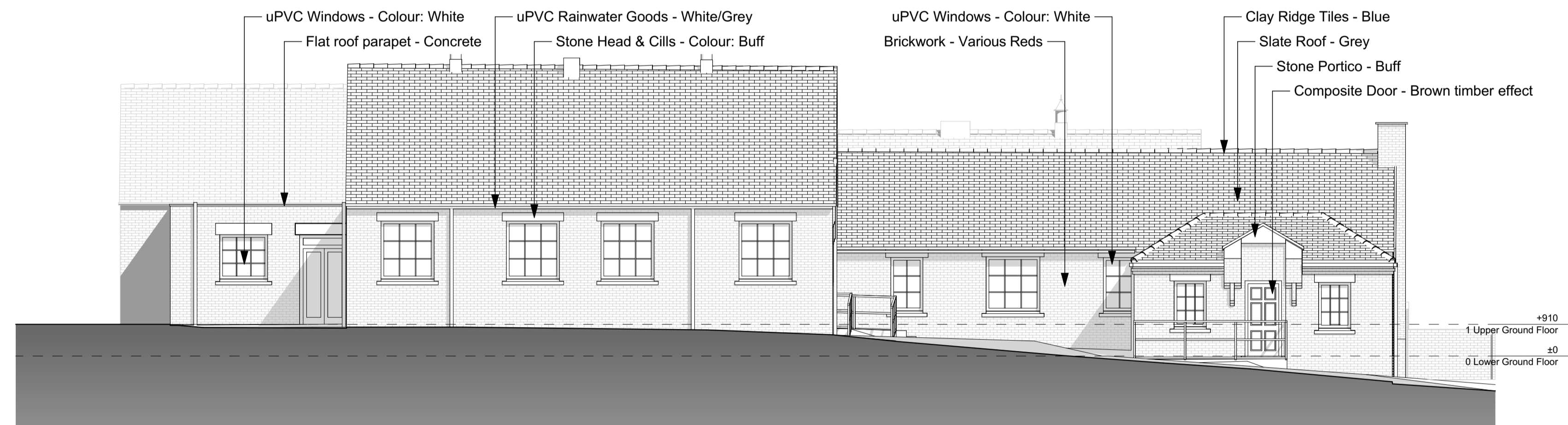
Concept South Elevation