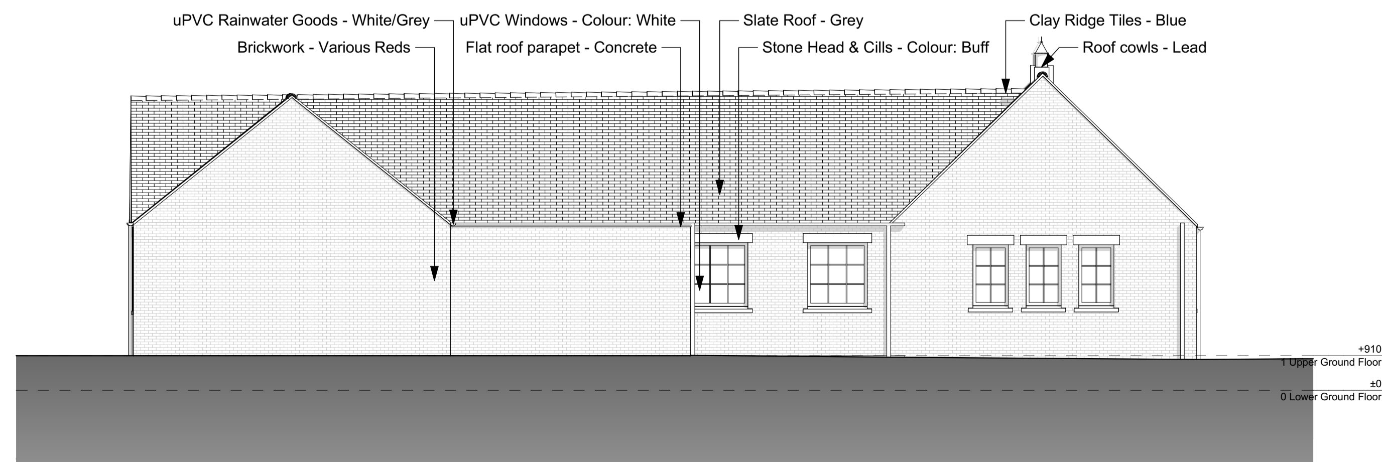
Concept West Elevation

NOTE Drawing use for status issued for only. Feasibility & Planning drawings are not intended for construction or manufacture. J Mahoney Architects Ltd cannot accept any responsibility for issues arising due to this. All dimensions to be checked on site and any discrepancies to be notified prior to the commencement of work. Do not scale from this drawing. If in doubt ask © J Mahoney Architects Ltd