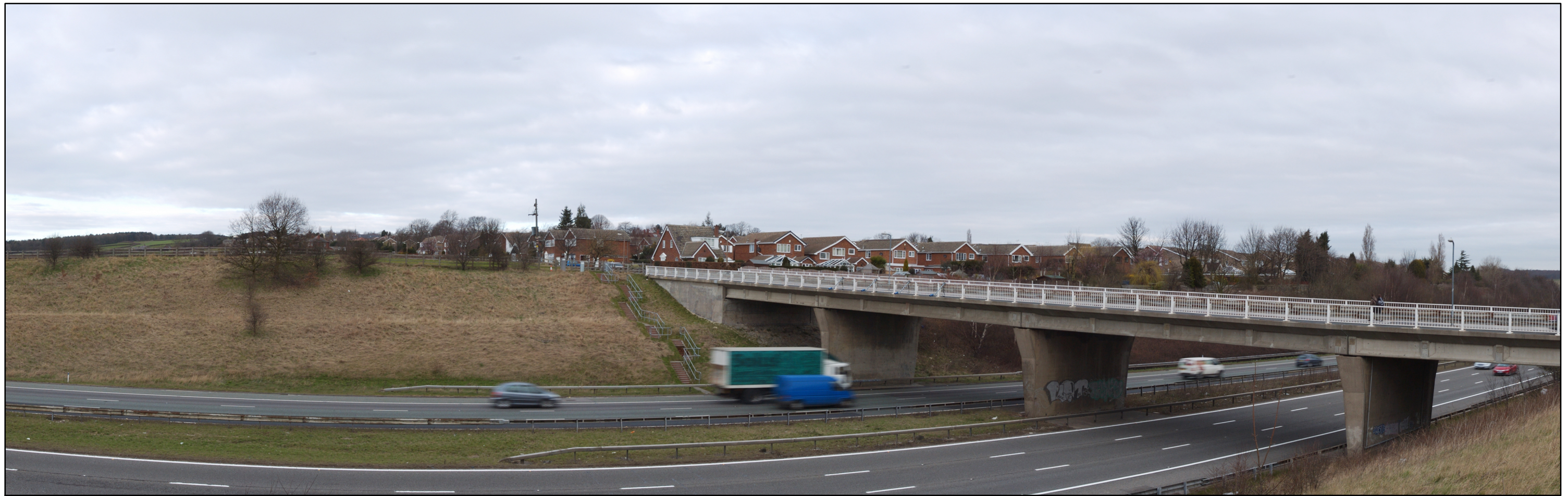
Existing view from viewpoint