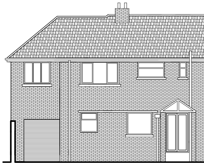
PROPOSED REAR ELEVATION SCALE 1:100 AT A3